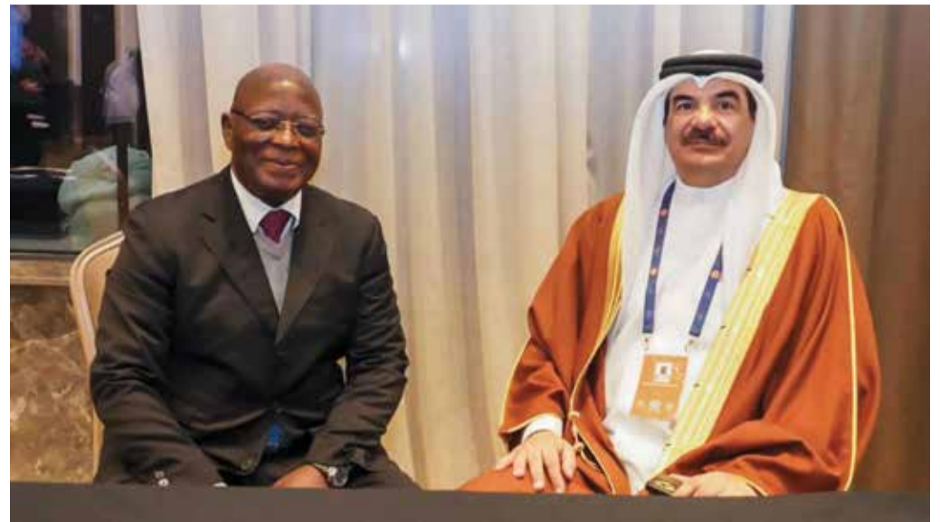
HE Engineer Mohammed Ibrahim Al-Sisi Al-Buainain, Secretary-General of the Bahraini House of Representatives, met with African Parliamentary Union Secretary-General HE Eddy Gadou Aboubakar during the 152nd IPU Assembly. Al-Sisi Al-Buainain condemned recent Iranian attacks on the Kingdom as a "dangerous escalation" and a violation of international law, urging the international community to take a firm stand. The meeting also focused on strengthening legislative ties between Bahrain and African nations to support global stability and development.