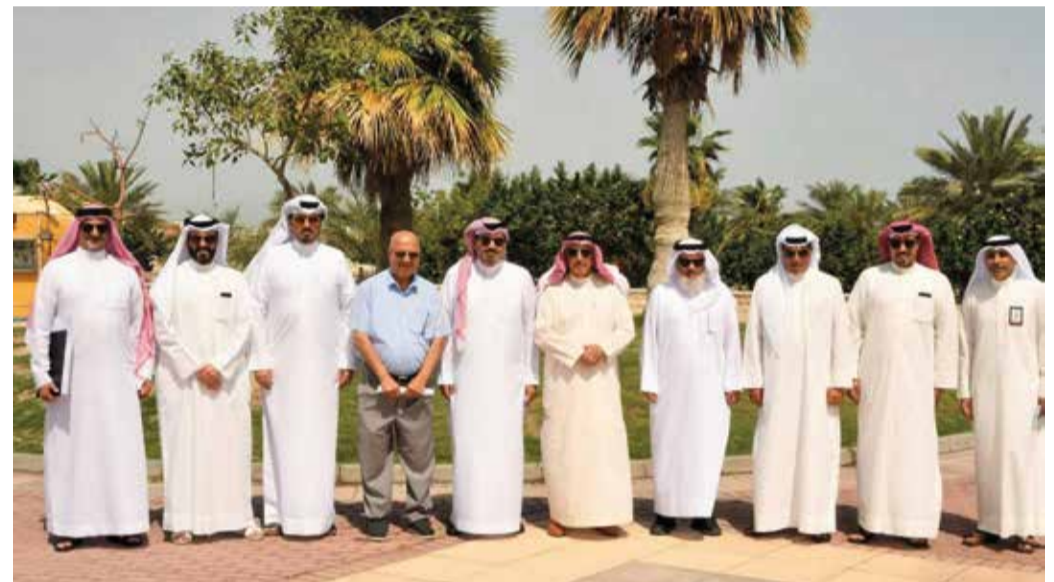
Governor HE Salman bin Isa bin Hindi Al-Mannai has announced a project to develop the Arad Park flag platform into a permanent national monument. The initiative, discussed in a coordination meeting with municipal leaders, aims to preserve Muharraq's historical identity and enhance spaces for national celebrations. The project is a collaborative effort between the Governorate, Muharraq Municipality, and engineering firms. Once completed, the monument will serve as a key destination for official events, symbolizing national unity and the Kingdom's cultural heritage.