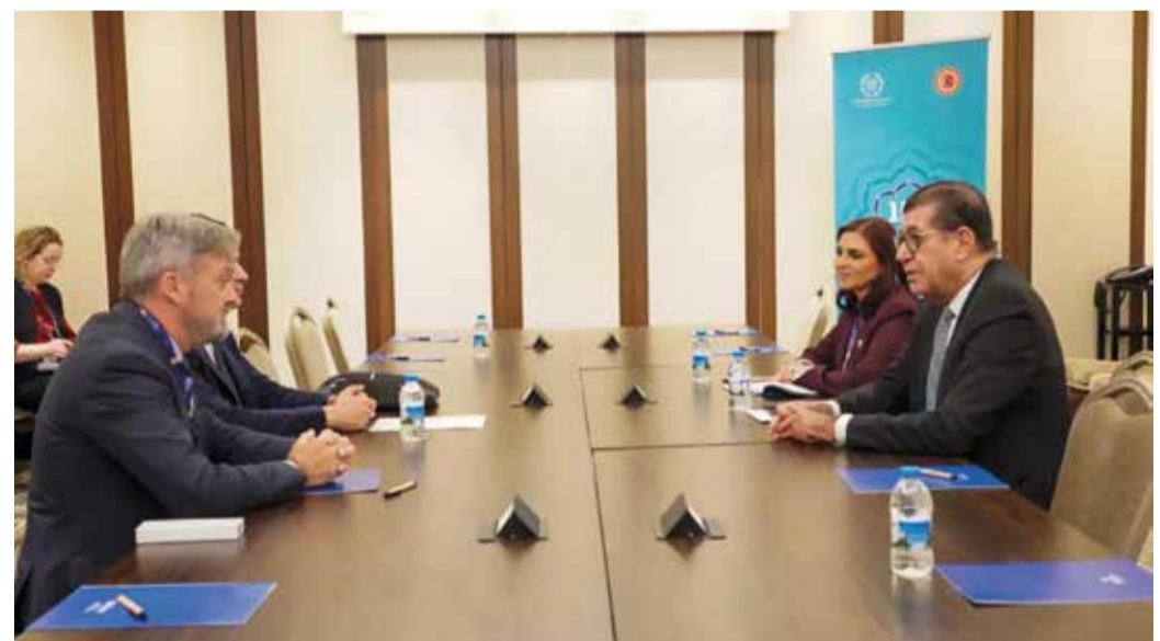
HE Jamal Mohammed Fakhro, First Deputy Chairman of the Shura Council, briefed an Australian parliamentary delegation on an emergency proposal submitted by Bahrain and the UAE at the 152nd IPU Assembly. The proposal calls for a formal international rejection of Iranian attacks targeting GCC nations and Jordan, citing widespread UN support for regional security. Mr. Fakhro urged global parliaments to protect civilians and vital infrastructure, while the Australian delegation reaffirmed its commitment to supporting peace and stability in the Middle East.