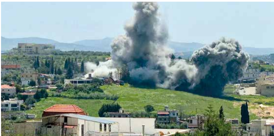
Smoke rises from the site of a series of Israeli strikes that targeted the southern Lebanese city of Nabatieh

"These two Leaders have agreed that in order to achieve PEACE between their Countries, they will formally begin a 10 Day CEASEFIRE at 5 P.M. EST," Trump