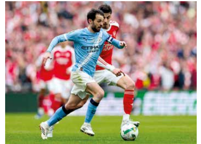
Manchester City's Portuguese midfielder #20 Bernardo Silva (L) vies with Arsenal's German midfielder #29 Kai Havertz (R)