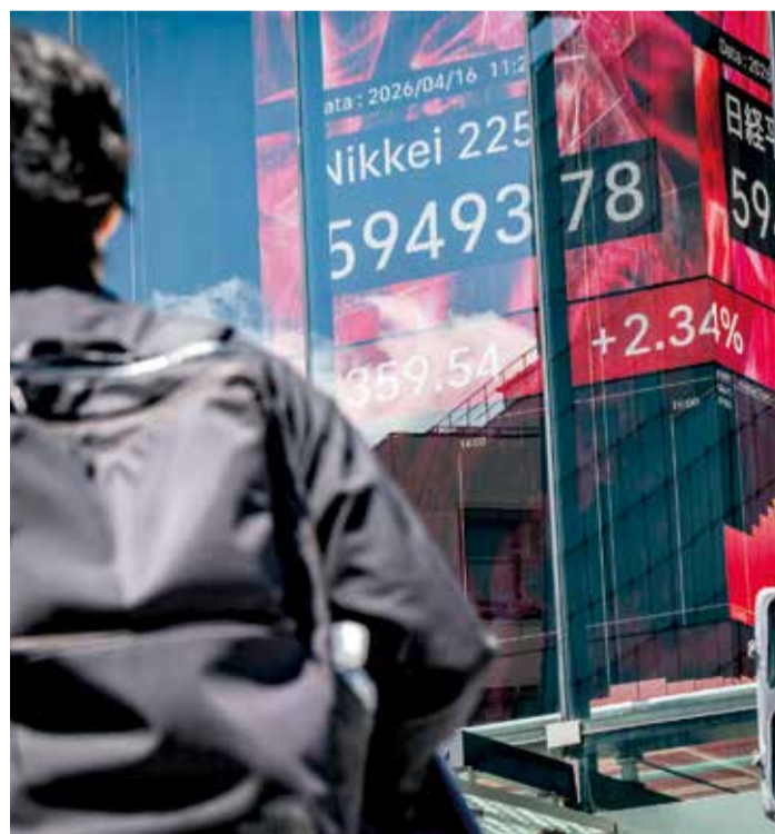
A man looks at an electronic quotation board displaying the Nikkei Stock Average on the Tokyo Stock Exchange in Tokyo

At the same time, "oil prices remain elevated... as investors look towards a possible extension of the ceasefire between