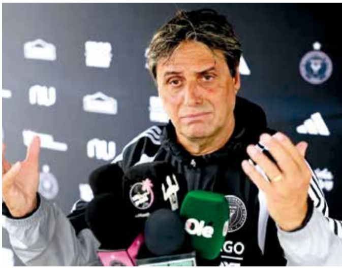
Head Coach Guillermo Hoyos of Inter Miami CF talks to the media prior to a training session