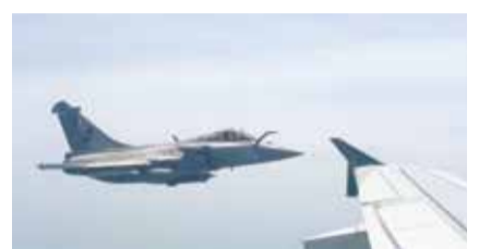
PM Shehbaz Sharif receives fighter jet escort on arrival in Qatar

During the visit, Prime Minister Sharif held a bilateral meeting with the Amir of Qatar, Shaikh Tamim bin Hamad Al Thani. The leaders discussed ways to strengthen bilateral relations and ex-