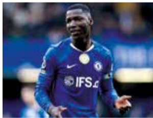
Moises Caicedo

Chelsea midfielder Moises Caicedo has agreed a new long-term contract with the club, extending his stay at Stamford Bridge until 2033, according to reports.