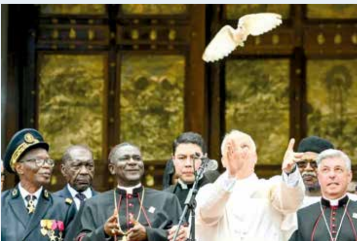
Pope Leo XIV releases a white dove after calling for peace in Cameroon

"Woe to those who manipulate religion and the very name