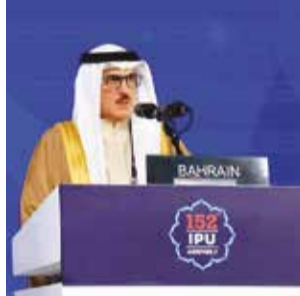
Ahmed bin Salman Al Musallem, Speaker of Parliament

He emphasised that Bahrain's legislative framework actively