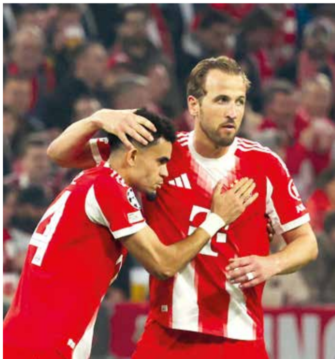
Bayern Munich forward Harry Kane celebrates with winger Luis Diaz

"Sometimes, you can be the dominant team and lose, so it's nice to get through and win this one."