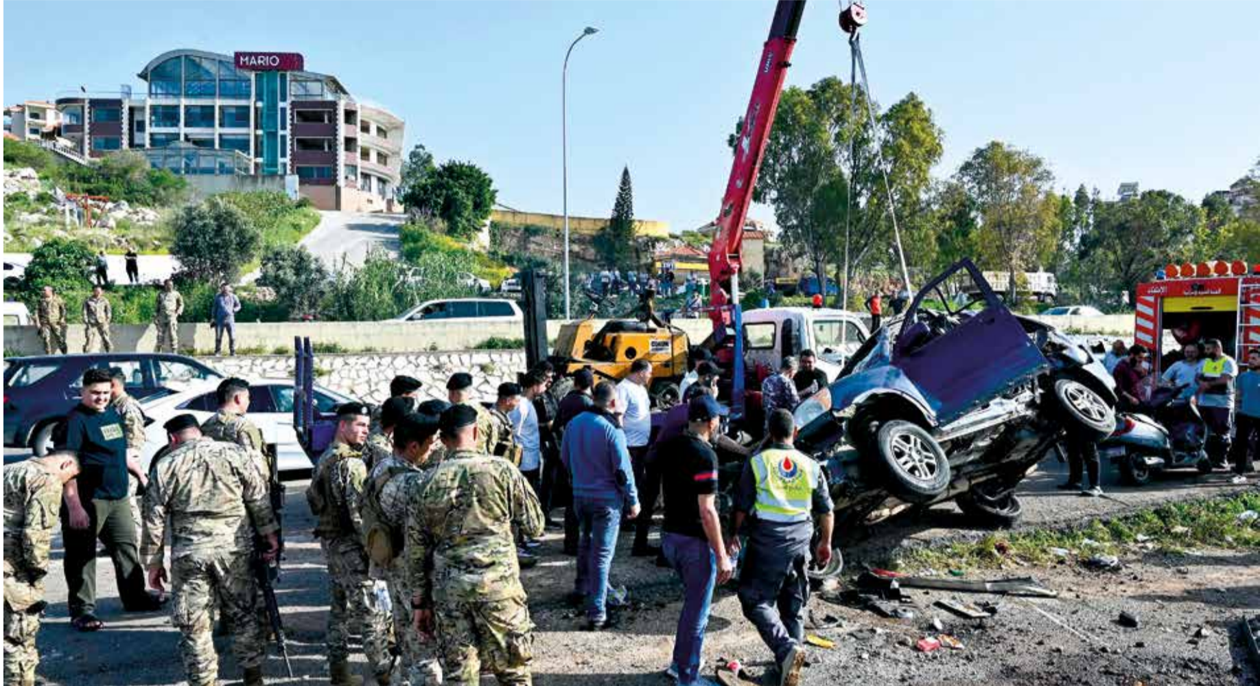
Lebanese army soldiers secure the site of an Israeli drone attack that targeted a vehicle on the highway of Saadiyat, south of Beirut

"I've introduced Articles of Impeachment against Pete Hegseth for violating his oath, endangering U.S. servicemembers, and committing war crimes, including attacks on civilians and a girls' school in Minab, Iran," Ansari wrote on X.