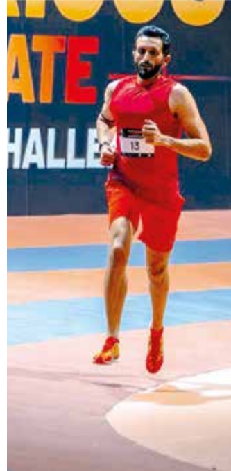
HH Shaikh Nasser in action TDT | Manama