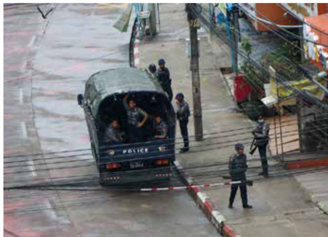
Police security forces stand by inside a police vehicle and on the sidewalk of Hledan Road in Kamayut township in Yangon