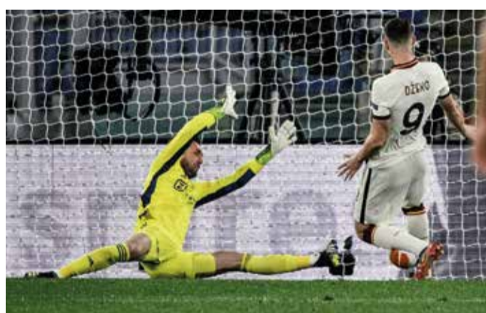
Roma's Bosnian forward Edin Dzeko (R) scores an equalizer past Ajax Dutch goalkeeper Maarten Stekelenburg

Italy's only remaining representative in Europe came into the clash at the Stadio Olimpico with a slender lead but two away goals from last week's first leg in Amsterdam.