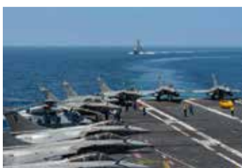
ENCEAU 21 mission".

The battle group, usually composed of a carrier air wing, a complement of 60 aircraft, is currently engaged in the "CLEM-