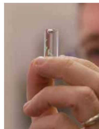
The green gel, seen in a lab, contains a microchip which senses when the body is infected

"As you truncate that time, as you diagnose and treat, what