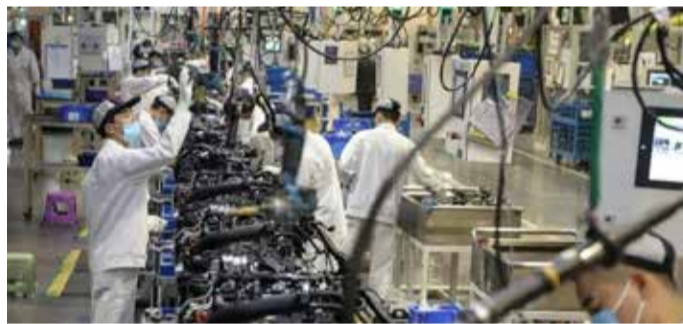
Industrial output rose a less-than-estimated 24.5 percent in the quarter.

"The national economy made a good start," National Bureau