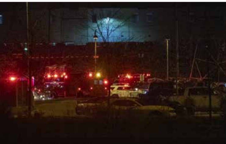
The scene outside a FedEx facility in Indianapolis where multiple people were reportedly shot

Shooter killed himself after shooting in which several others were wounded