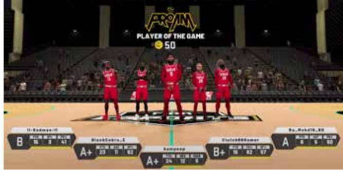
Bahrain's players line-up on screen after their win against Lebanon

● Bahrainis among 60 national teams from around the world taking part in online tournament, featuring NBA 2K21 platform