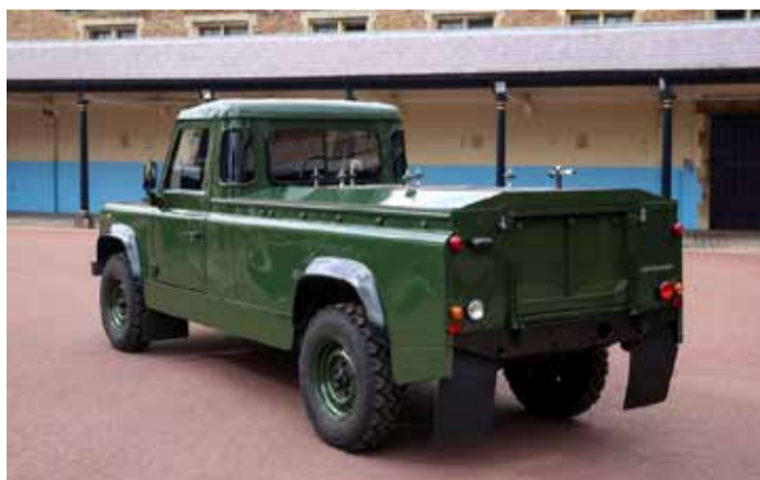
The Jaguar Land Rover that will be used to transport the coffin of Prince Philip

entirely at Windsor Castle on Saturday, with no public allowed.