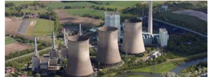
An aerial picture shows the four natural-gas power plants "Gersteinwerk" of Germany's RWE Power, one of Europe's biggest electricity and gas companies near the North Rhine-Westphalian town of Hamm, Germany