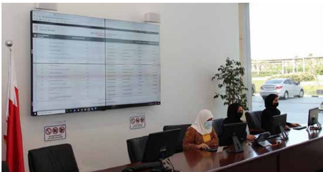
The bid opening process was attended by representatives of the administering authorities and the companies participating in the tenders

As per a tender, the ministry will construct a six-meter wide two-lane single carriageway internal roads, with asphalt paving