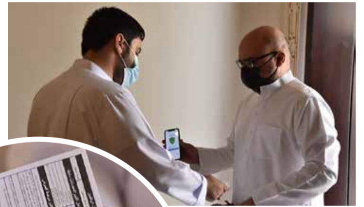
In pictures, worshippers performing Friday prayers at various mosques in the Kingdom

● Worshippers entered after showing proof for COVID-19 vaccination