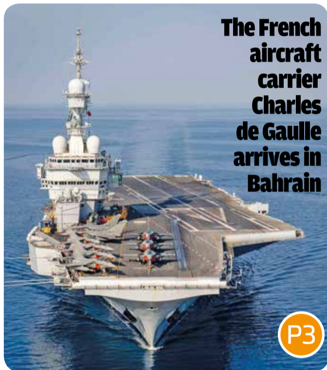
The French aircraft carrier Charles de Gaulle arrives in Bahrain

Abbas Araqchi, Iran's chief nuclear negotiator at nuclear talks in Vienna, said on Tuesday that Iran would activate 1,000 advanced centrifuge machines at Natanz.