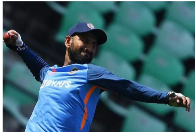
India's Cheteshwar Pujara attends a practice session in Nagpur (file photo)