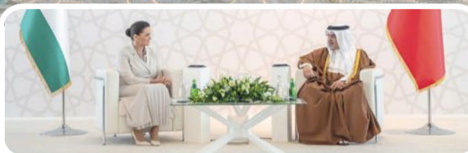
In pictures, HRH CP, PM and Hungary's Novak at EDB during deal signing

The deal signing at the EDB headquarters in Bahrain Bay was in the presence of His Royal Highness Prince Salman bin Hamad Al Khalifa, the Crown Prince, Prime Minister and Chairman of the Economic Development Board (EDB) and the President of Hungary, Katalin Novak. His Royal Highness