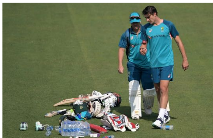
Australia's captain Pat Cummins (R) and his teammate David Warner take part in a practice session at the Arun Jaitley Stadium in New Delhi

"You saw this year at the Boxing Day Test when he puts pres-