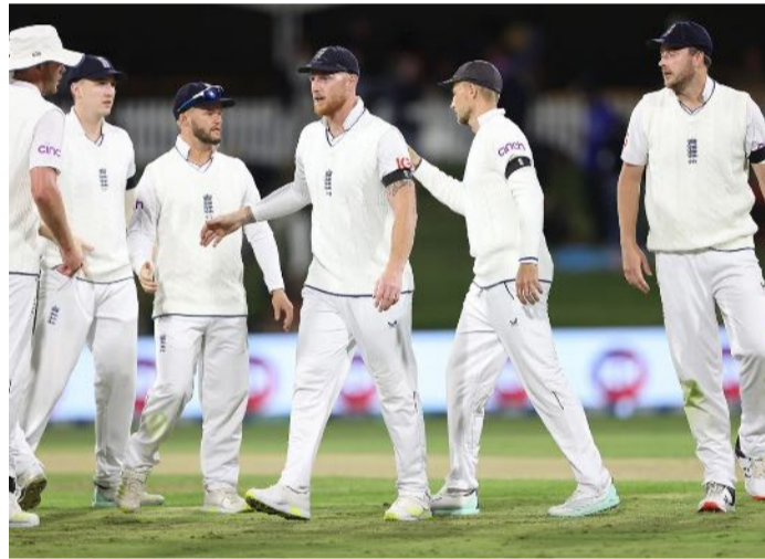
Ben Stokes of England talks to teammates at the conclusion of day one

The tourists raced to their total in just 58.2 overs -- boosted by blistering half-centuries to Ben Duckett and Harry Brook -- as England opened the two-Test series with the sort of attacking approach, dubbed "Bazball", that has carried them to nine wins from their past 10 Tests under coach Brendon McCullum. England captain Ben Stokes instructed his lower-order batsmen to throw the bat before calling them in, leaving 18 overs to bowl at the Black Caps under lights with a new pink ball. The ploy worked as Tom Latham, Kane Williamson and Henry Nicholls departed before reaching double figures. Evergreen seamer James Anderson took 2-11, including the key wicket of Williamson following an lbw review. Opener Devon Conway will resume on 18 and nightwatchman Neil Wagner on four, with a deficit of 288 runs staring at them on Friday. It was a grim response to an England innings that featured 48 fours and one towering six from Brook off the bowling