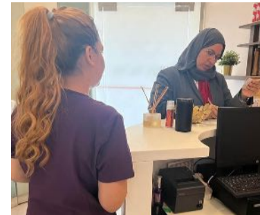
The Labour Market Regulatory Authority (LMRA) conducted joint inspection campaigns at shops and work sites in Muharraq and the Northern Governorate yesterday. Cases of violation were identified and referred for legal action. LMRA reiterated its appeal to report any breaches through its website, www.lmra.bh , or by calling the authority's call centre at 17506055.

traded insults with each other. The incident reportedly happened after school hours. The ministry said it has opened an investigation, and those involved will receive appropriate penalties. However, it is not clear how many students are involved or the reason for the noisy altercation.