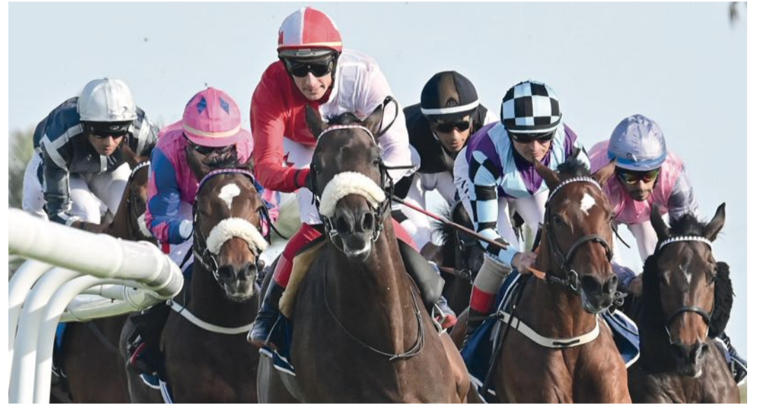
Action from a previous race day at REHC