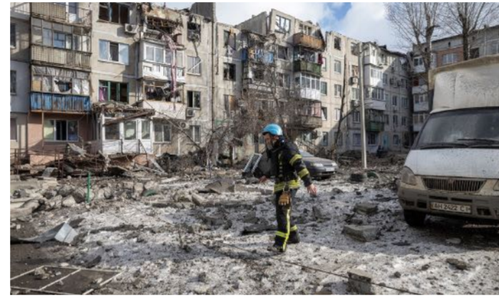
A firefighter walks at a car park near an apartment block that was heavily damaged by a missile strike in Pokrovsk, Donetsk region, Ukraine

Russia rained missiles across Ukraine yesterday and struck its largest oil refinery, Kyiv said, while the head of the Wagner mercenary group predicted the long-besieged city of Bakhmut would fall within a couple of months.