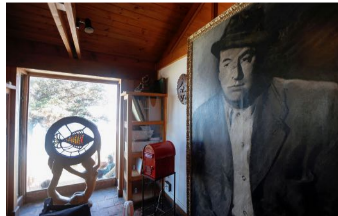
A picture of Chilean poet and Nobel laureate Pablo Neruda is seen inside his museum house in the coastal sector of Isla Negra, Chile

A third inquiry into the death of Chilean poet Pablo Neruda 50 years ago could shed new light on whether he was poisoned by political enemies, as alleged by some of his family.