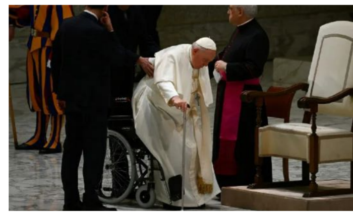
Pope Francis goes to sit in his wheelchair prior to meet with attendees during the weekly general audience

The resignation of a pope should not become the norm within the Catholic Church, and that prospect is not "on my agenda", Pope Francis