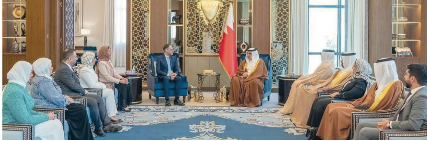
HRH CP, PM during talks with the President of the Bahrain Medical Society at Gudaibiya Palace