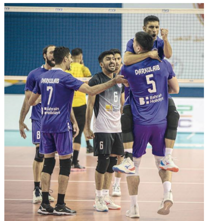
Dar Kulaib players celebrate a victory in a Bahrain league match

Meanwhile, Group A features Kuwait SC of Kuwait, Police SC of Qatar, Almeena VC of Yemen, Oman SC of Oman and home team Al Wehdat.