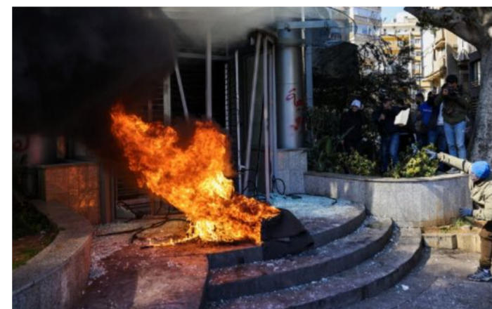
A protester throws a brick at a bank after setting fire to tyres during a demonstration in Beirut

Dozens of angry demonstrators attacked several banks in Beirut yesterday after the Lebanese pound hit a record low amid a deepening economic crisis.