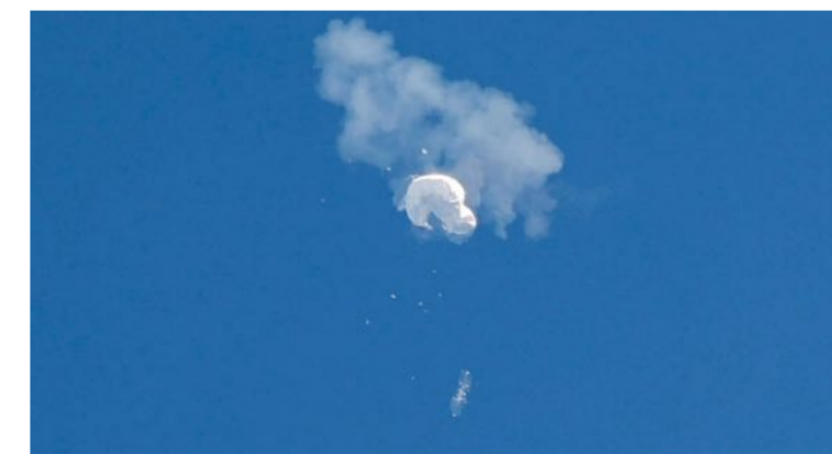
The suspected Chinese spy balloon drifts to the ocean after being shot down off the coast in Surfside Beach, South Carolina (file photo)