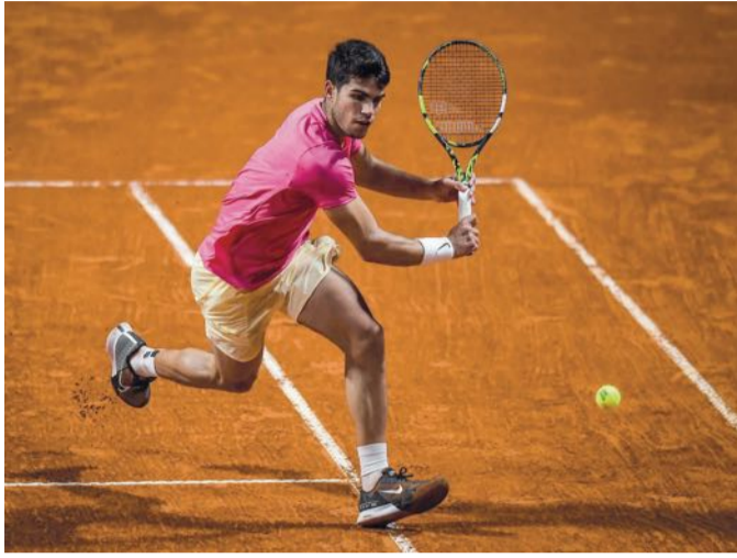
Spanish tennis player Carlos Alcaraz returns the ball to Serbian tennis player Laslo Djere during