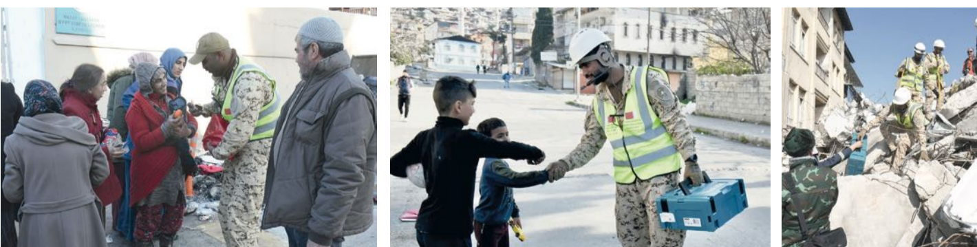
In the pictures above are Bahrain's rescue team members in action at quake-hit areas in Türkiye. Bahrain's rescue efforts follow the directives of His Majesty King Hamad bin Isa Al Khalifa, the Supreme Commander of the Armed Forces.

also confirmed they require $400 million to sufficiently respond to the most pressing humanitarian needs over the next three months. Besides, in a re-