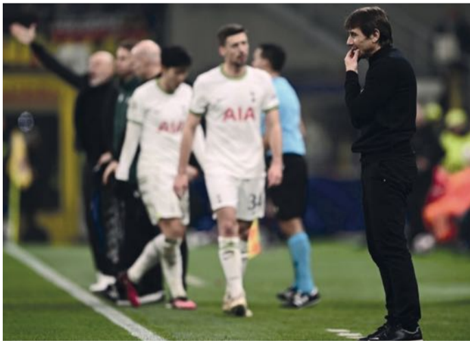
Tottenham Hotspur’s head coach Antonio Conte (R) reacts during a match

Conte experienced “severe abdominal pain” that was later