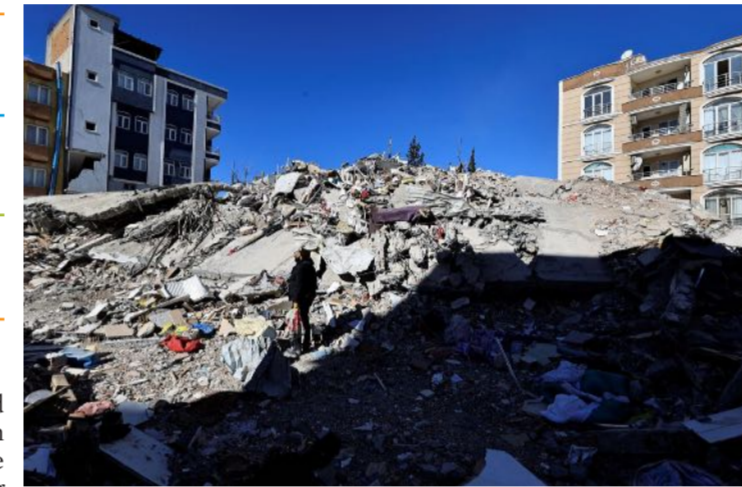
People take their belongings from their apartments in the aftermath of a deadly earthquake in Antakya

A teenage girl was pulled alive from the rubble in Turkey yesterday more than 10 days after a devastating earthquake hit the region, but such rescues have become increasingly rare, leaving anger to smoulder as hope dies.