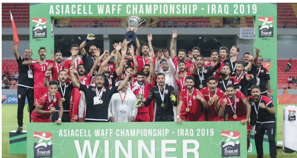
Flashback: Bahrain players and team officials celebrate winning their first-ever WAFF title in 2019 in Iraq (File photo)