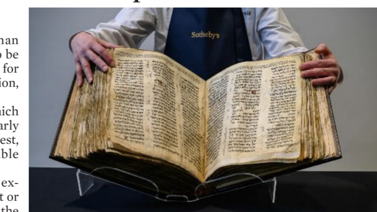
The 'Codex Sassoon' bible is displayed at Sotheby's in New York

(It) is undeniably one of the most important and singular texts in human history