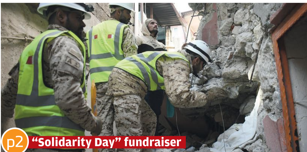
Members of Bahrain Royal Guard in action at the quake hit areas in Hatay, Turkiye

The Royal Guard commandos of the Bahraini Defence Force are pushing ahead with their search, rescue and relief operation in Turkiye and Syria, extending much-needed help to families who are still awaiting news of their missing relatives, more