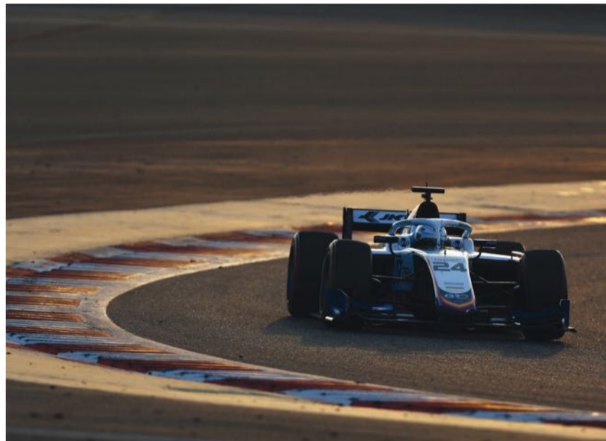
Kush Maini during testing yesterday as the sun sets at BIC

The F2 and F3 joint-tests this week at BIC allowed F2's 22 drivers and F3's 30 contenders to get some mileage in