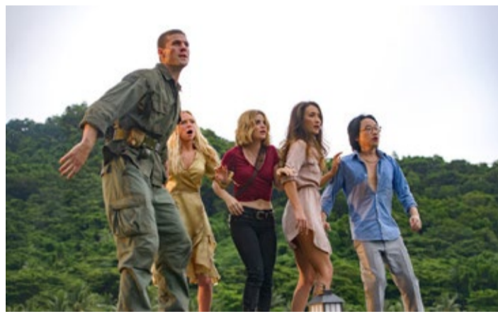
A scene from 'Fantasy Island'

A horror version of “Fantasy Island,” frankly, sounds more interesting than a conventional reboot, which explains why Sony would hand the keys to Blumhouse, the reigning maestro of that genre, and let them run with it. That seed of potential, however, sails away on a tide of numbing stupidity. A frantic woman races through the jungle as the movie begins, serving notice that this isn’t grandma’s “Fantasy Island,” the escapist TV show that premiered in 1978. That tease is followed by more familiar images, as a handful of contest winners land on an idyllic island (played by Fiji, incidentally), before being ushered in to meet their host, the mysterious Mr. Roarke (Michael Pena), who walks them through the rules. Their fantasy, he explains, will be “as real as you make it,” in a locale where “anything and everything is possible.” But they must see each experience through to its conclusion, setting them on disparate adventures, which -- barring