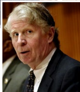
Manhattan District Attorney Cyrus Vance briefs the press