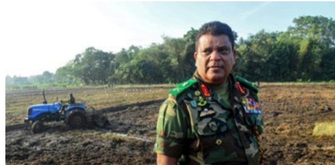
Washington barred Sri Lankan army chief Shavendra Silva over alleged war crimes linked to the ending of the civil war

"The minister said this action unnecessarily complicates the US-Sri Lanka relationship," his office said in a statement