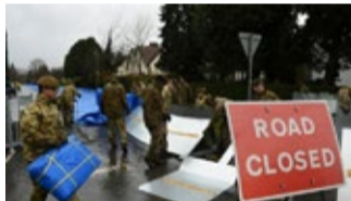
Troops have been deployed in West Yorkshire, northern England, which suffered badly from flooding caused by last weekend's Storm Ciara

The Ministry of Defence had earlier deployed troops in West Yorkshire, northern England, which suffered badly