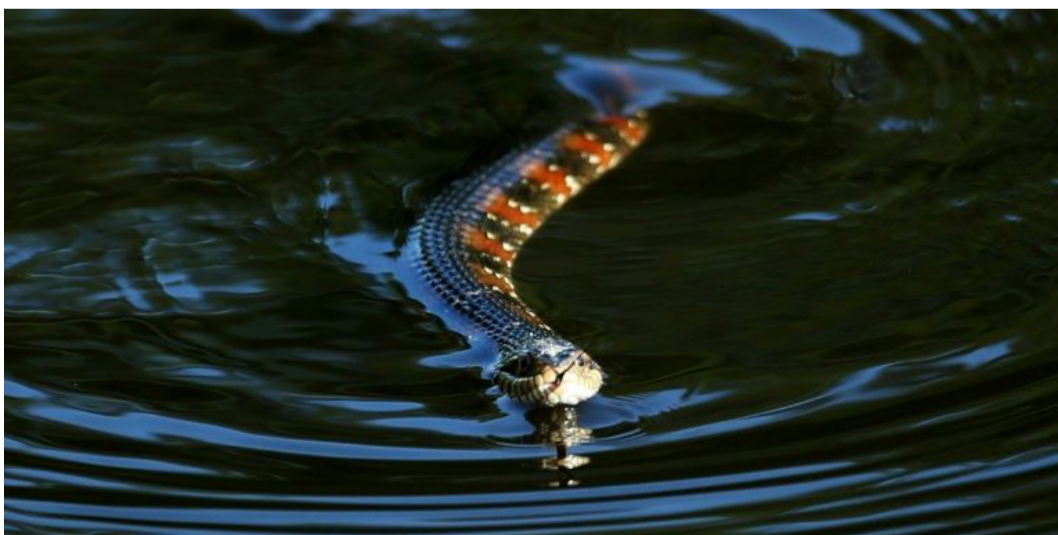
One resident said he saw around 25 Florida water snakes gather at a park in Lakeland, southwest of Orlando

They are generally found resting in tree limbs over water or basking on shorelines. They are an important part of the ecosystem and should not be disturbed