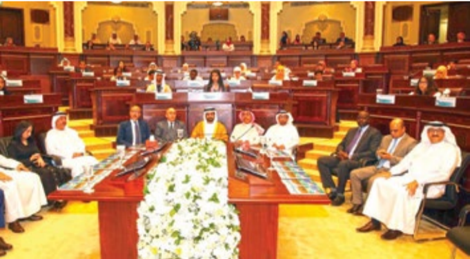
The session addressed child participation in developing education, curricula and textbooks.

“The third session of the parliament addressed issues and challenges related to Arab chil-