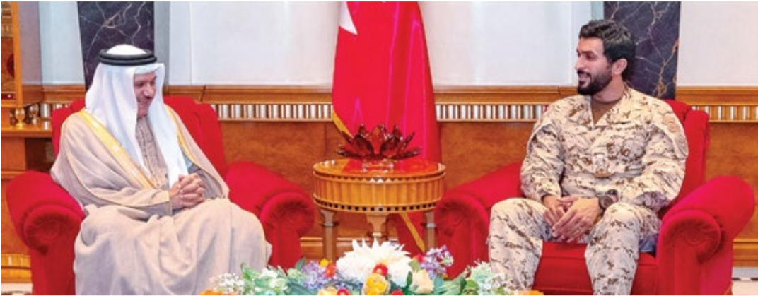
HH Shaikh Nasser receives Dr Al Zayani.

HH Shaikh Nasser congratulated Dr Al Zayani on the precious royal trust bestowed upon him through his appointment to his post, wishing him every success in assuming his duties, and continuing the successes achieved by Bahraini diplomacy in many fields.