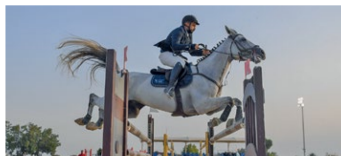
A participant in action during the showjumping championship