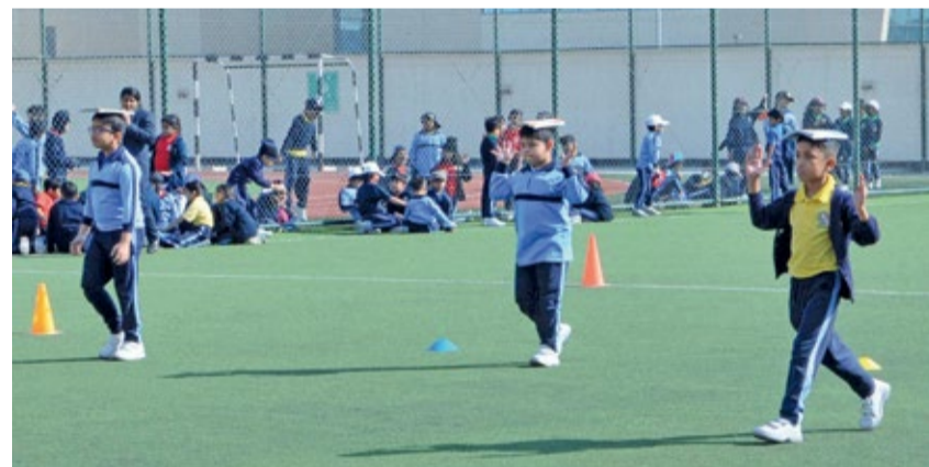
Students compete during the Annual Sports Week of New Millennium School, DPS Bahrain. Notable events the races including 100mts, 200mts, 400mts, 800mts, relay, Shot-put, discuss throw, long jump, etc. Prize distribution was held at the conclusion of each event