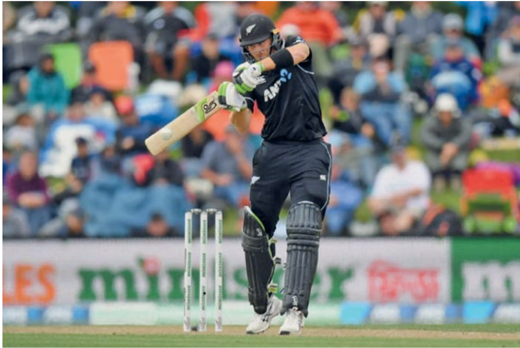
Martin Guptill plays a shot

Against India's tight bowling, Guptill was restricted to a top score of 15.