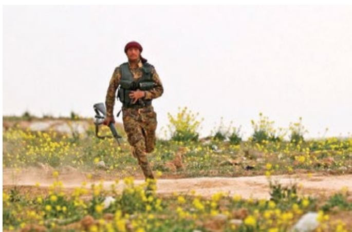
A fighter with the US-backed Syrian Democratic Forces runs with a weapon during an operation to expel Daesh militants from the Baghouz area.

Pence said: "The time has come for our European partners to stand with us and with the Iranian people, our allies and friends in the region. The time has come for our European partners to withdraw from the Iran nuclear deal."