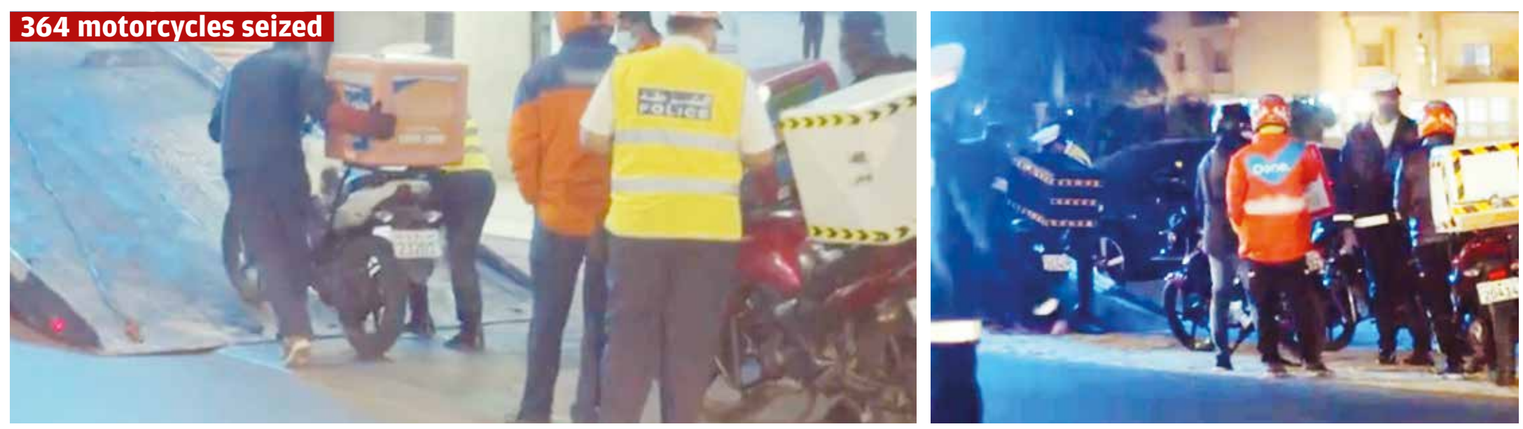
The General directorate of traffic seized 364 motorcycles for violating traffic rules and regulations while delivering food for restaurants. Necessary legal measures are taken.