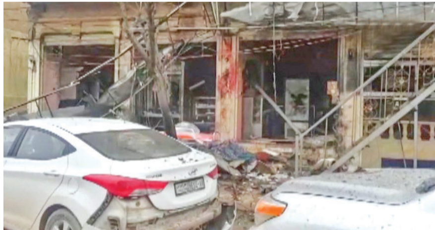
The aftermath of a suicide attack in the northern Syrian town of Manbij.

A US official who declined to be named said four US troops had been killed and three wounded in the blast, which a Daesh-affiliated site said was the work of a suicide bomber. Others said only two had been killed.