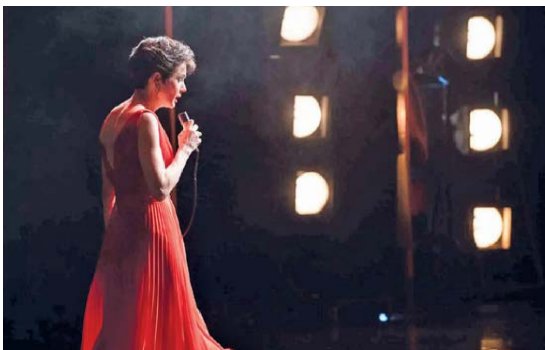
Renee Zellweger as Judy Garland in 'Judy'

In L.A., it's especially easy to see a celebrity, or someone with fame or riches, and assume they have it all figured out. But no one has it all figured out. That goes for the folks you see walking down the street, and it even goes for a superstar like Judy Garland. She seemed to be on top of the world. From 1939-1961, everyone wanted her beaming