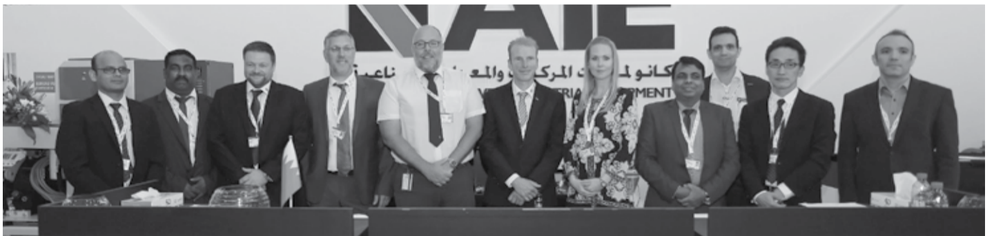
KAIE signs an exclusive deal with Butzbach to expand their portfolio to include hangar doors