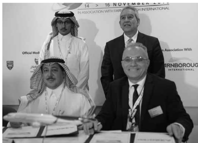
Signing the deal