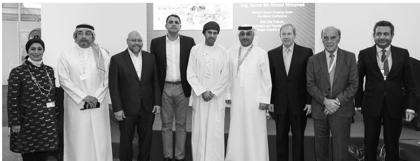
Officials during a photocall at a conference held at BIAS. More than 50 aviation leaders participated in this year's Bahrain International Airshow (BIAS) Airport Conference. Hosted by Bahrain Airport Company (BAC) under the patronage of the Minister of Transportation and Telecommunications Kamal Ahmed, the conference discussed the latest issues shaping the region's aviation sector.

The agreement is aimed at developing the overall level of service at BIA and ensuring all ground handling operations adhere to international standards.