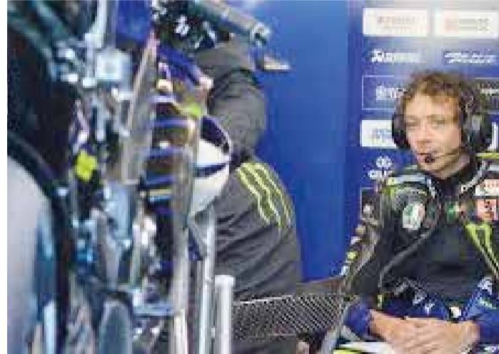
Valentino Rossi looks at his motorbike in his pit (file photo)

the factory Yamaha team, had endured a tough season with three successive crashes leaving "The Doctor" down in 13th in the world championship.