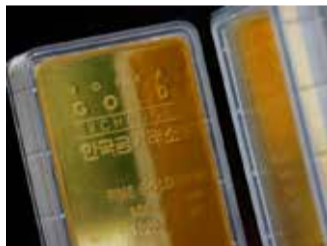
Gold bars are pictured on display at Korea Gold Exchange in Seoul, South Korea