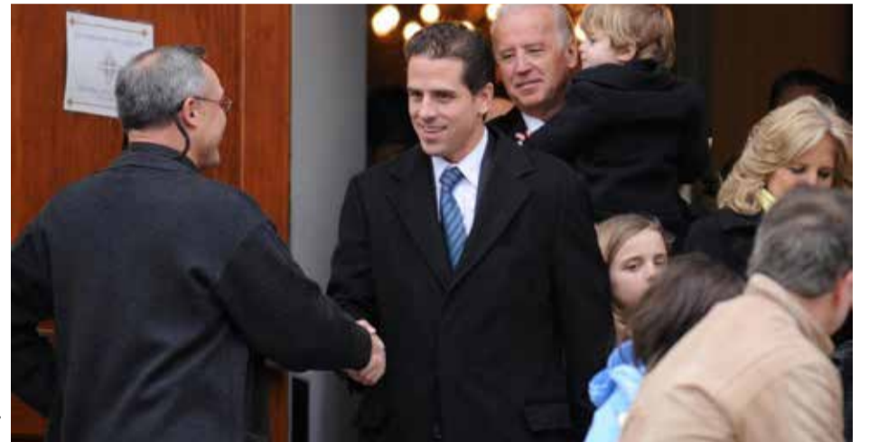
Joe Biden and his son Hunter Biden depart after a church service (file photo)

US President Donald Trump rebuked Facebook and Twitter for blocking links to a New York Post article purporting to expose corrupt dealings by election rival Joe Biden and his son in Ukraine.