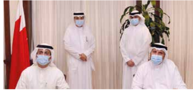
The deal signing