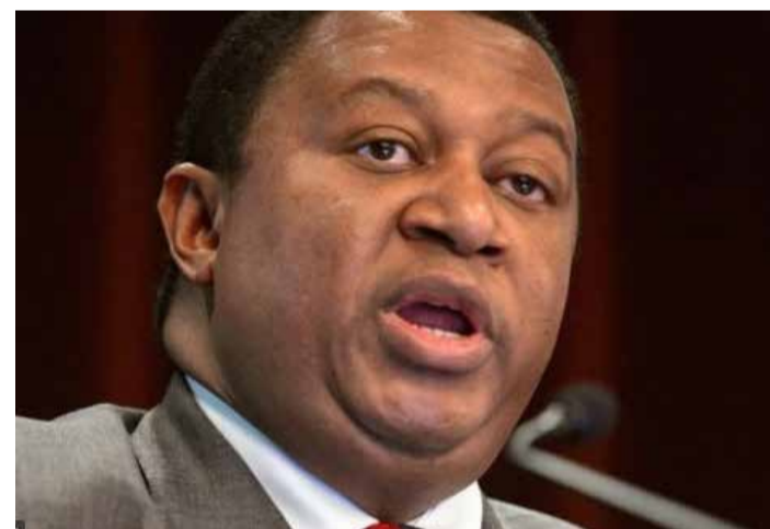
On Thursday, OPEC Secretary General Mohammad Barkindo told a conference that demand was recovering at a slower pace than expected.

General Mohammad Barkindo told a conference that demand was recovering at a slower pace than expected.