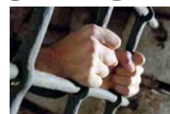
Representative picture

Police arrested the suspected based on a tip-off received. Based on the information,