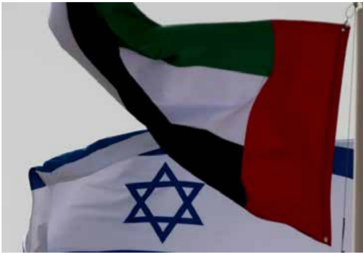
Emirati and Israeli flags fly upon the arrival of Israeli and U.S. delegates at Abu Dhabi International Airport, in Abu Dhabi, United Arab Emirates

● Israel's parliament, Foreign Minister Gabi Ashkenazi said Abu Dhabi was expected to send its first official delegation to Israel next week