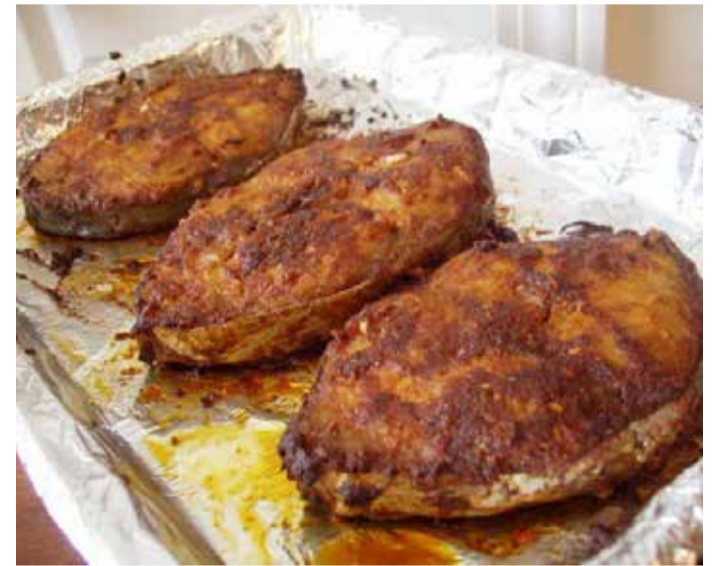
Representative picture

In a statement yesterday, the agency appreciated the cooperation and commitment of fishermen in abiding by the regulations meant for replenishing fish stocks in the Kingdom.