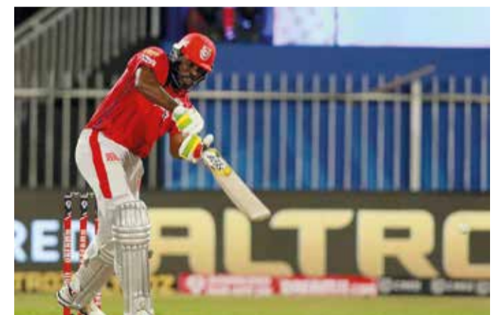
Kings XI Punjab's Chris Gayle plays a shot