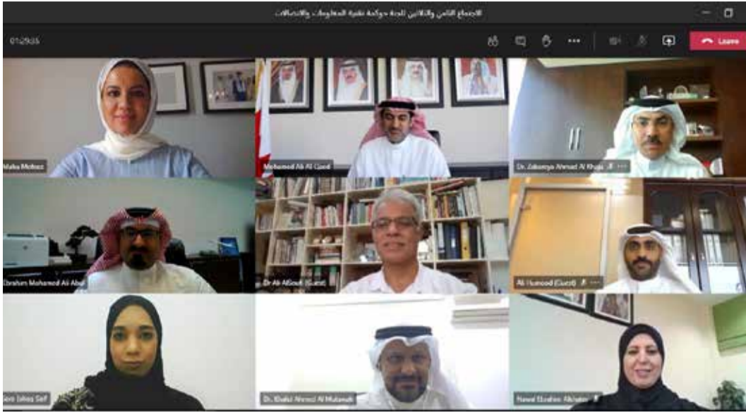
Officials during the meeting

Bahraini government strategic projects and procurement requests worth around BD4 million came for dis-