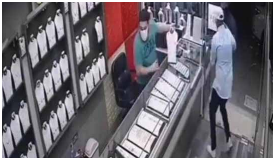
Surveillance footage obtained from the jewellery shop