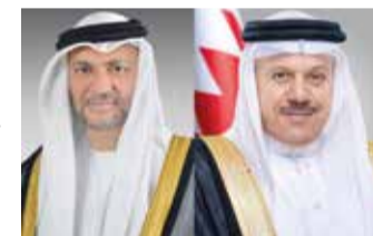
Dr Anwar Mohammed Gargash, Dr Abdullatif bin Rashid Al Zayani

The ministers reviewed common stances of both countries regarding various regional and international issues and