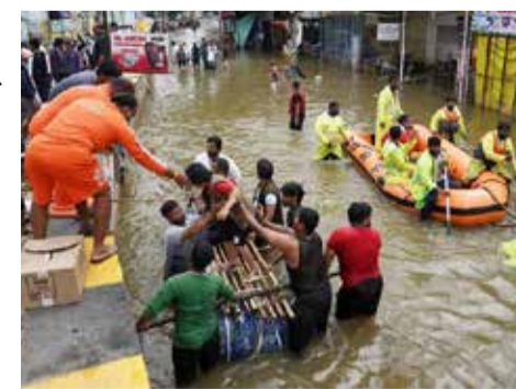
Residents are evacuated from a flooded

Authorities in Hyderabad declared a holiday yesterday and asked residents to