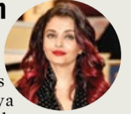
Aishwarya Rai Bachchan