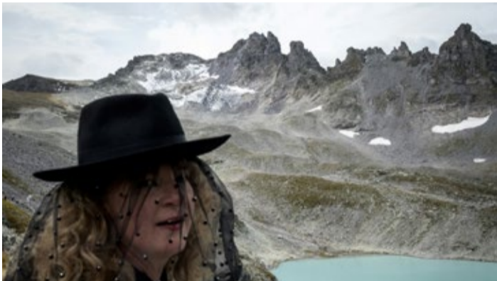
The new study on Switzerland's melting glaciers comes less than a month after a "funeral march" was held on a steep mountainside to mark the disappearance of the Pizol glacier

The study, released amid growing global alarm over climate change, found that intense heatwaves over the summer in Switzerland had dashed hopes that an exceptionally snow-filled winter would limit the