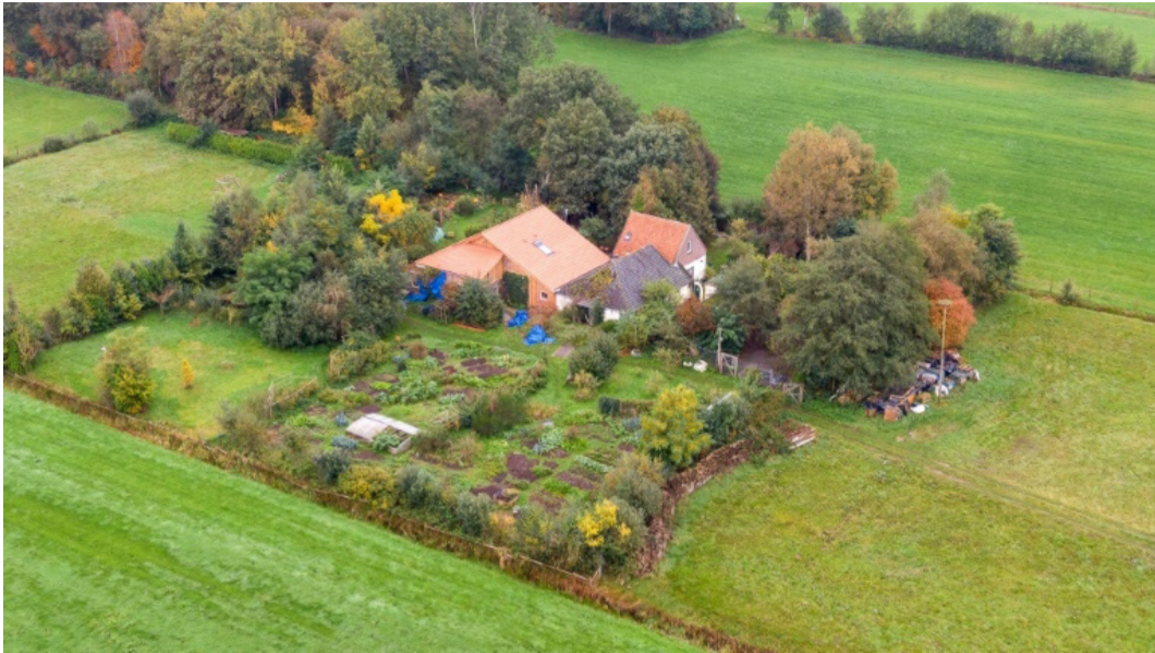
The family lived isolated in the farm for nine years

lieved to be the father of the family, and his children aged between 18 and 25 near the village of Ruinerwold in the northern province of Drenthe.