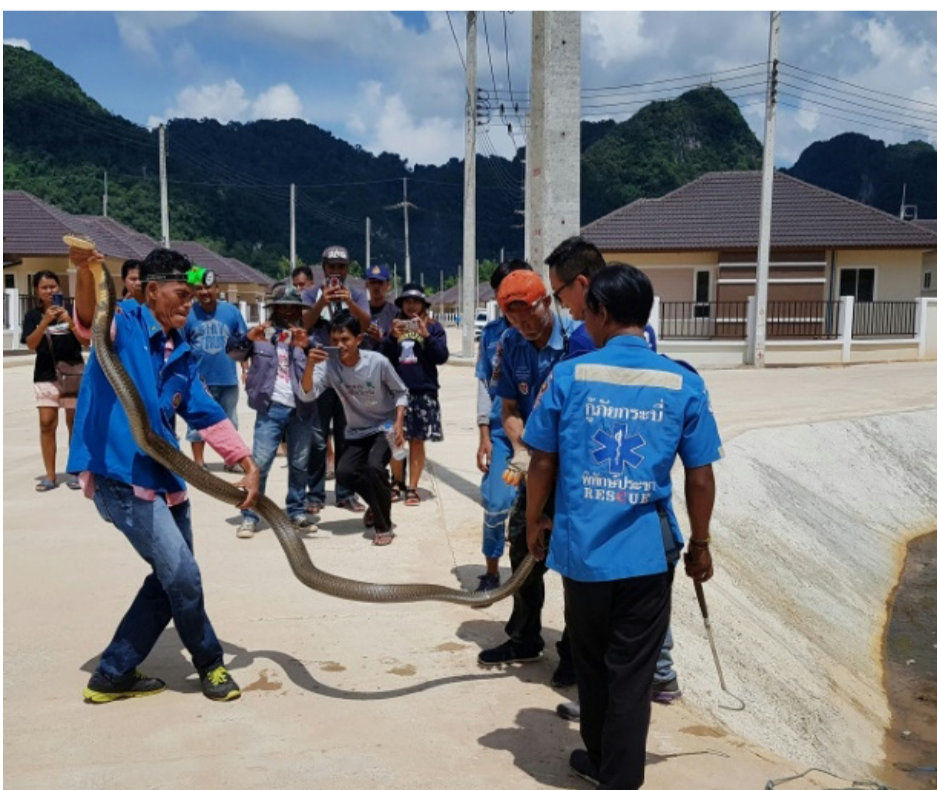
Krabi Pitakpracha Foundation snake rescuers released the giant cobra into the wild after capturing it

Kritkamon said the snake was more than four metres long,