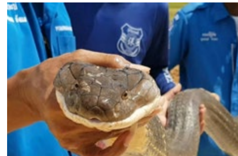
A Krabi Pitakpracha Foundation snake handler holds the four-metre (13 feet) king cobra he pulled from a sewer in southern Thailand

weighed 15 kilos (33 pounds), and was the third-largest they had found.