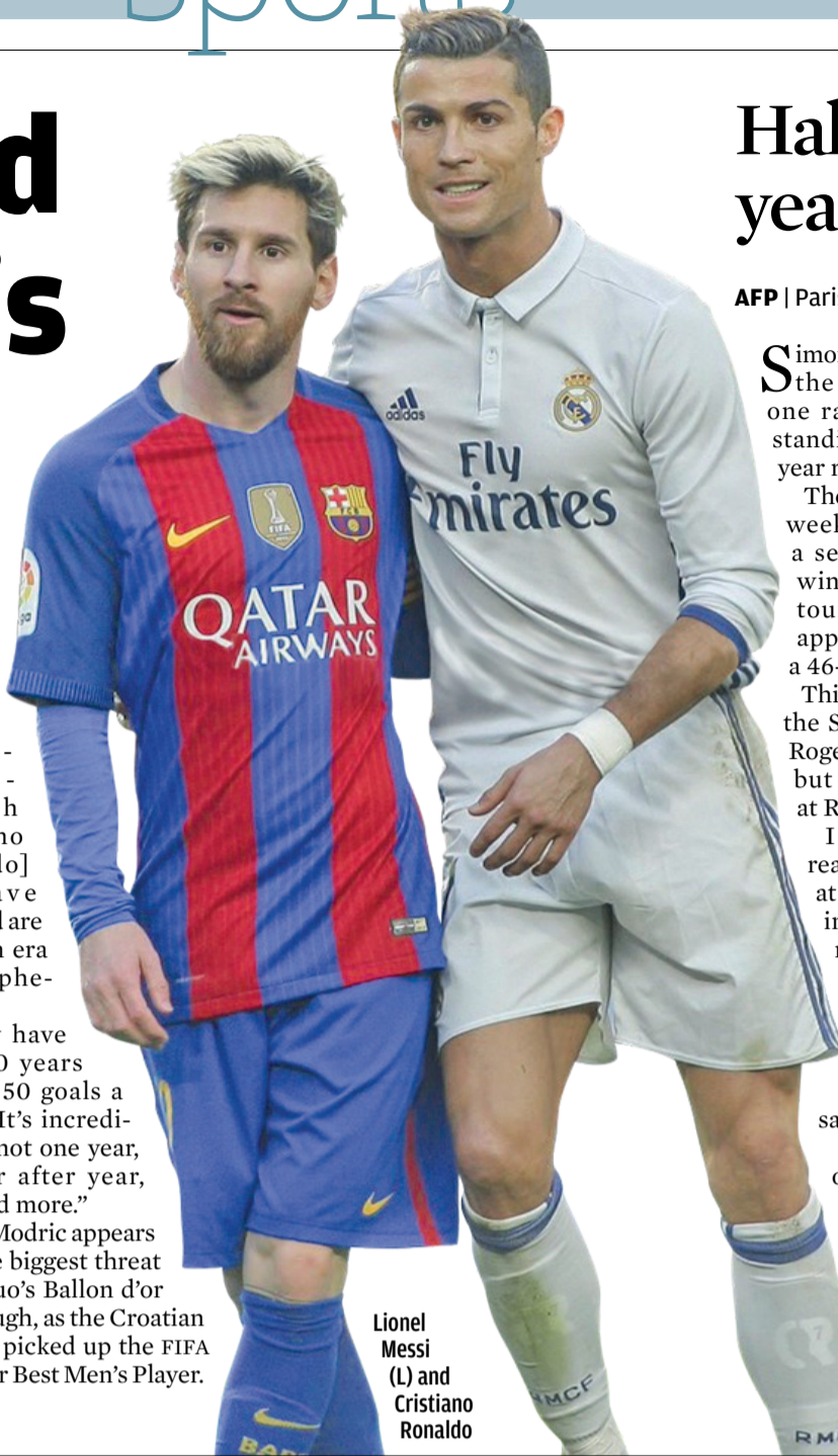
Lionel Messi (L) and Cristiano Ronaldo

Luka Modric appears to be the biggest threat to the duo's Ballon d'Or run, though, as the Croatian recently picked up the FIFA award for Best Men's Player.