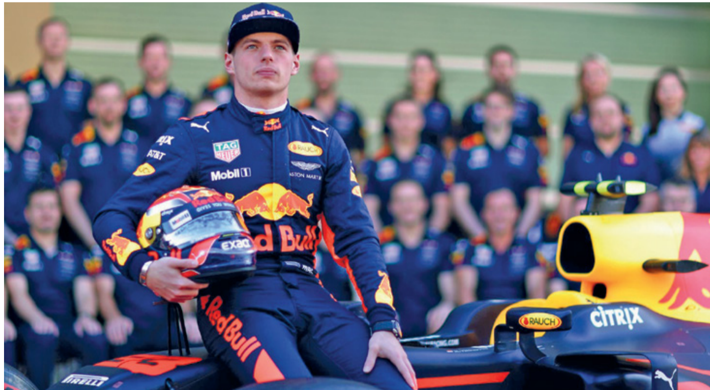
Max Verstappen feels qualifying should be more a shorter session