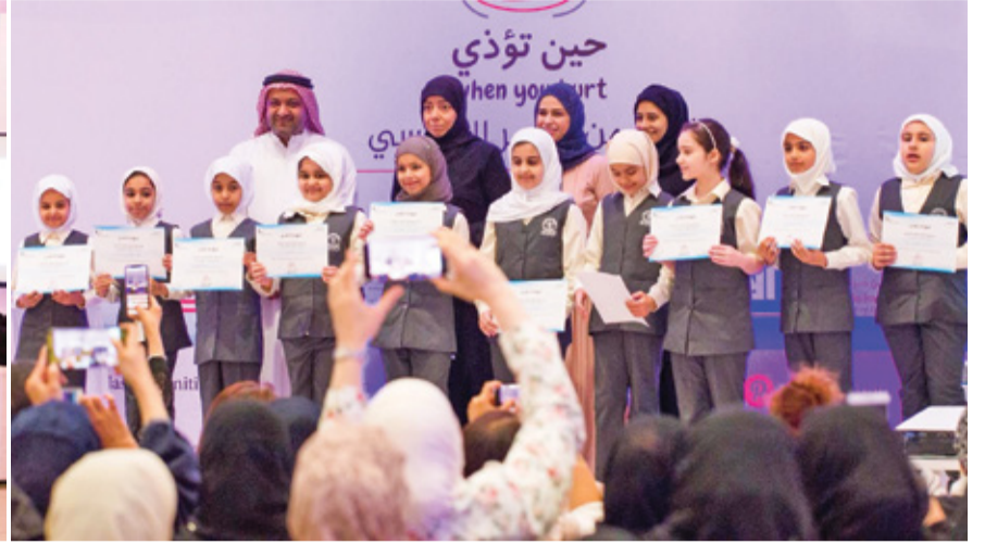
Students who underwent anti-bullying training at the event.

” Bullying is divided into three types that include physical, verbal and social bullying. It consists of three parties, which are the bully, the victim and the spectator.