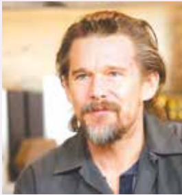
Ethan Hawke | Los Angeles