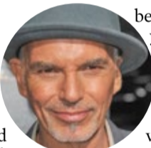
Billy Bob Thornton

Angelina Jolie might have cut off all ties with Brad Pitt after the two Hollywood superstars decided to call it quits for good, but she is still "good friends" with actor Billy Bob Thornton, with whom she was married for two years from 2000 to 2002. Thornton revealed this fact in an exclusive interview on Saturday. "We're good friends. We've