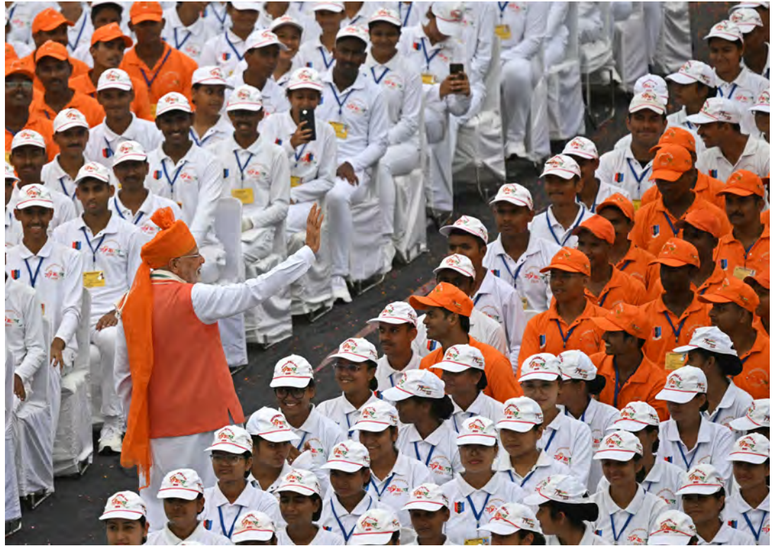
India's Prime Minister Narendra Modi waves to the members of National Cadet Corps (NCC) after addressing the nation from the ramparts of the Red Fort

Nature has tested us with landslides and cloudbursts; relief and rescue efforts are ongoing. Operation Sindoor showed our resolve after the Pahalgam massacre. Our forces, given full freedom, destroyed terrorist bases deep inside enemy territory. Bharat will not tolerate nuclear blackmail, nor will we allow