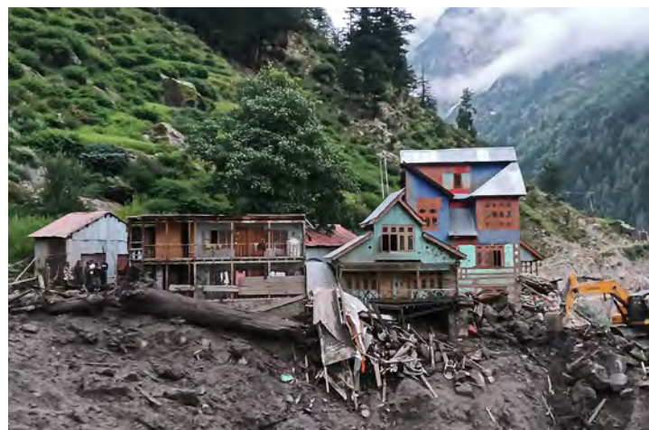
Rescuers (L) inspect the site of a flash flood at a village in India's Himalayan Kishtwar district

Officials said a large makeshift kitchen in Chisoti, where more than 100 pilgrims were, was com-