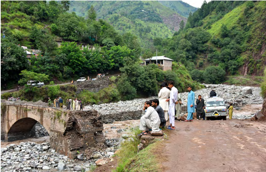
Onlookers gather near a destroyed bridge after flash floods on the outskirts of Muzaffarabad

Landslides and flash floods triggered by heavy monsoon rains across northern Pakistan have killed at least 199 people in the past 24 hours, national and local officials said yesterday. Of those killed, 180 were recorded in the mountainous Khyber Pakhtunkhwa province, where one resident likened the disaster to “doomsday”. Another nine people were killed in Pakistan-administered Kashmir, along with five in the northern Gilgit-Baltistan region, the National Disaster Management Authority said. Most were killed in flash floods and collapsing houses, with the dead including 19 women and 17 children. At least 28 others were injured. Another five people, including two pilots, were killed when a Khyber Pakhtunkhwa government helicopter crashed due to bad weather during a relief mission, the province’s chief minister, Ali Amin Gandapur, said in a statement. The provincial government has