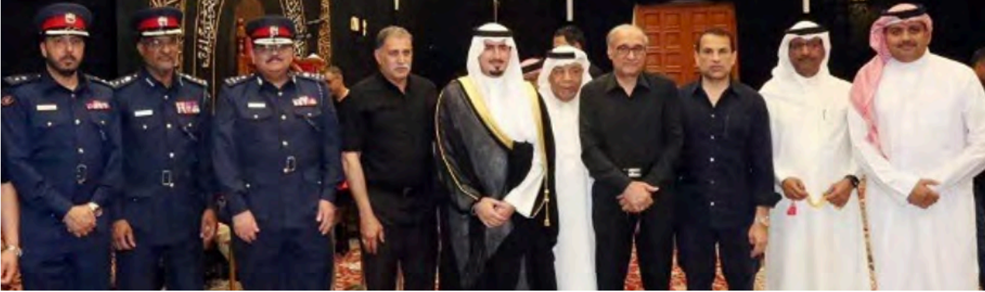
The Capital Governor, Shaikh Khalid bin Hamoud Al Khalifa, conducted an inspection tour of several community centres (Mattams) and processions' routes. The visit focused on reviewing organisational measures, available services, and ensuring that all necessary requirements were in place to maintain public security and safety for participants.