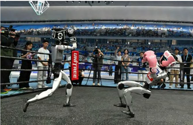
Two robots fight in a free combat style event during the World Humanoid Robot Games in Beijing