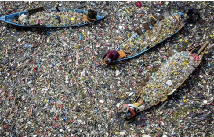
People on boats collect recyclable plastics from the heavily polluted Citarum River at Batujajar in Bandung, West Java, Indonesia