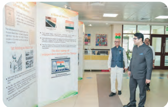
Pics credit: Ashen Tharaka