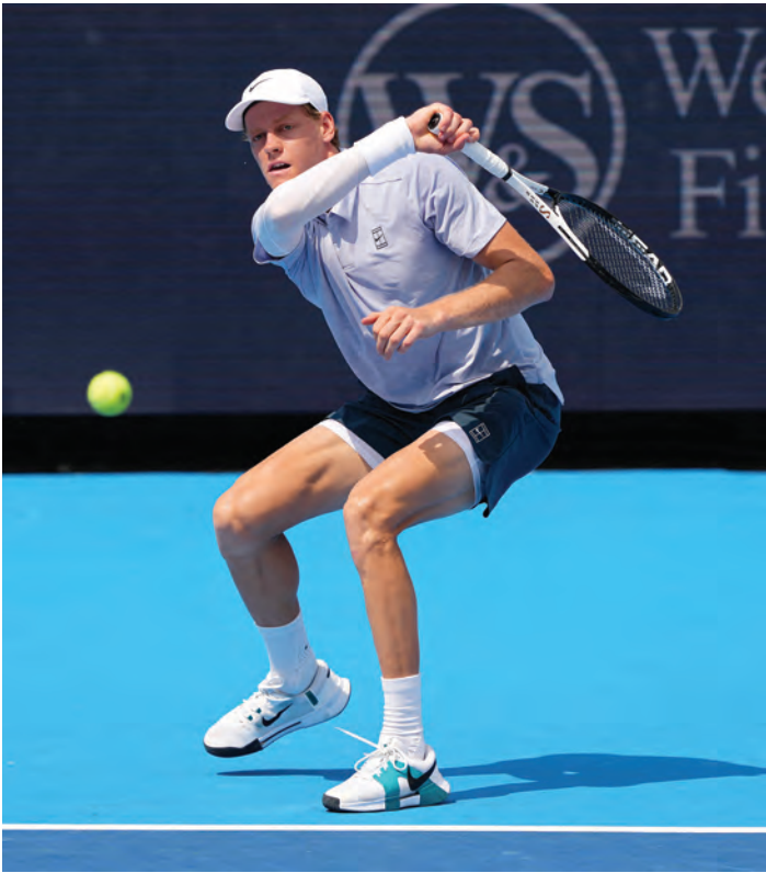
Jannik Sinner of Italy plays a forehand during the match against Felix Auger-Aliassime of Canada

“I felt great on the court today, you could see