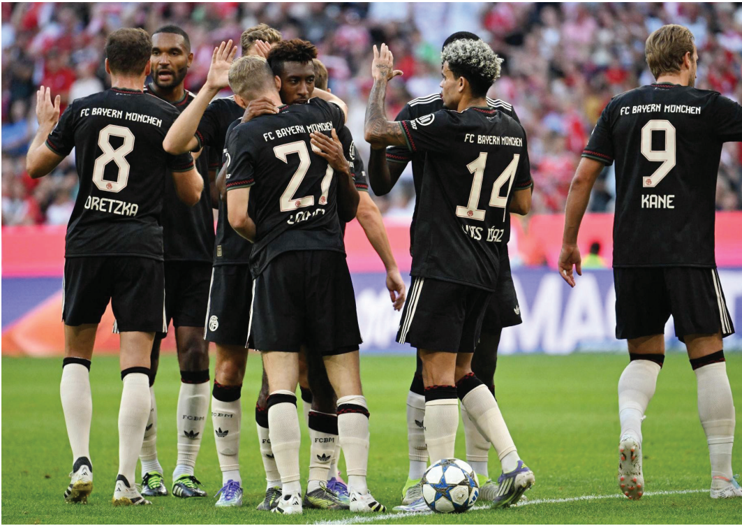
Bayern Munich's players celebrate a goal

Predecessors to the crown Borussia Dortmund, Bayer Leverkusen and cup holders Stuttgart are priming themselves for a run at Bayern Munich's Bundesliga title after a frustrating summer transfer window for the Bavarian giants. Bayern travel to Stuttgart on Saturday for the Franz Beckenbauer Supercup -- the season opener which pits the defending league champions against the reigning German Cup victors. Winners of 12 of the past 13 Bundesliga titles, Bayern occupy their usual role as favourites for the crown. This summer, however, the 34-time league champions have not had everything go their own way. Efforts to lure Florian Wirtz away from Leverkusen fell flat, with the German footballer of the year opting rather for a move to the Premier League and Liverpool.