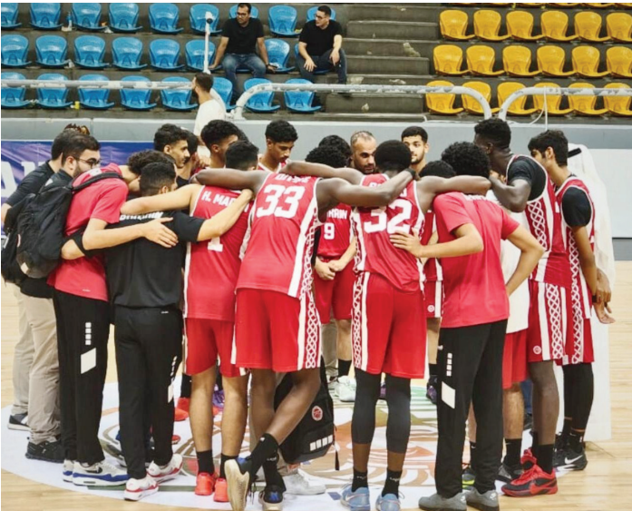
Bahrain's men rally for a team talk