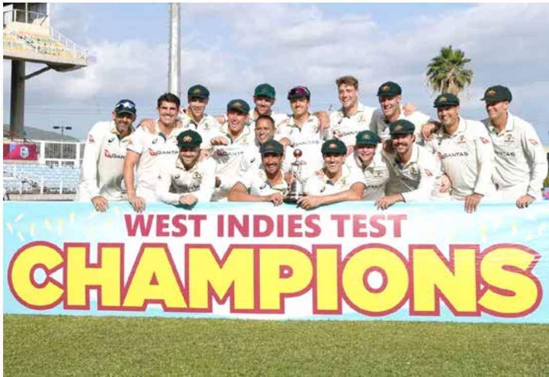
Australia's players pose with the trophy

West Indies captain Royston Chase warned his side must improve with the first of five T20