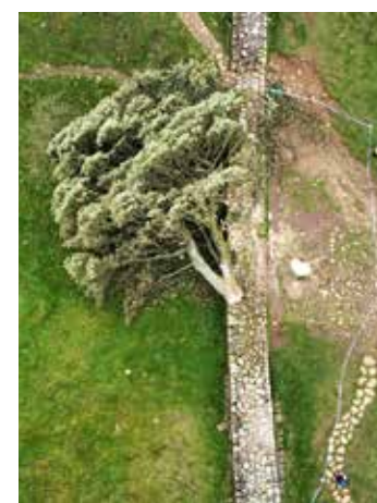
The felled Sycamore Gap tree

The pair were jointly charged with causing £622,191 ($832,821) of criminal damage to the tree and £1,144 of damage to Hadrian's Wall, an ancient