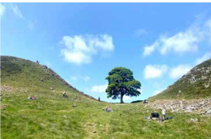
The Sycamore Gap tree along Hadrian's Wall near Hexham, northern England

Both men were convicted on two counts of criminal damage