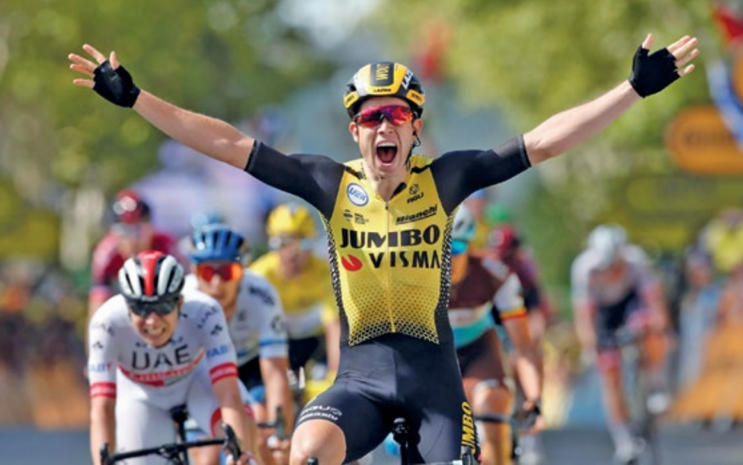
Wout van Aert celebrates after crossing the line

second placed Thomas by 1min 12sec, a second Ineos rider, Egan Bernal, is at 1min 16, and van Aert’s teammate Steven Kruijswijk is another 11sec off in fourth.