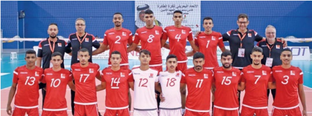
Bahrain team players with staff after a training session

He said that organising such an event is within the plans and goals of Rashid Equestrian and Horseracing Club’s High Committee, which aims to further contribute to the economic, tourism and sporting sectors in the Kingdom of Bahrain.