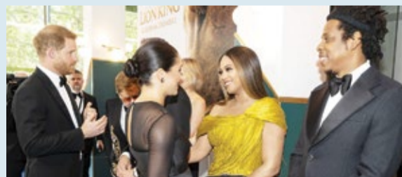
The singer voices Nala in the upcoming remake of the beloved 1994 Disney film.