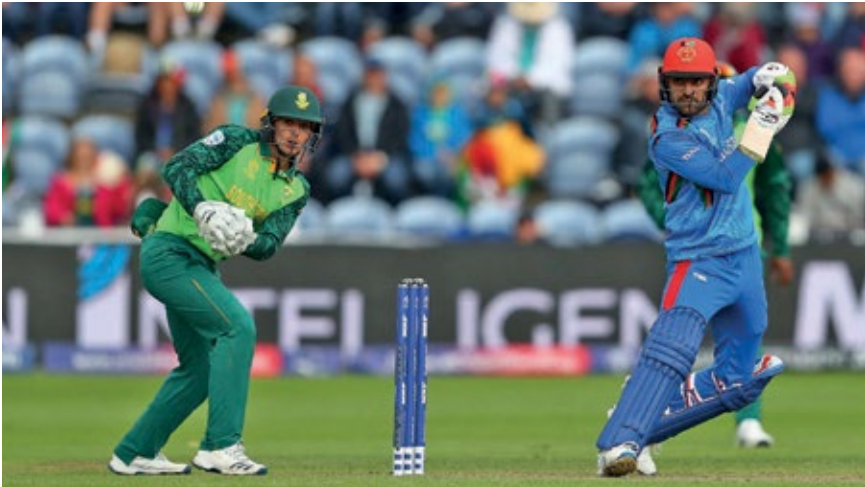
Afghanistan's Rashid Khan plays a shot as South Africa's Quinton de Kock looks on

Chris Morris trapped Rahmat Shah lbw for six and Afghanistan were 69-2 after 20 overs when the heavens opened again and the covers came on, with officials opting to reduce the match to 48 overs a side.