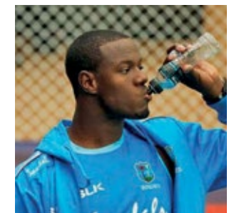
West Indies' Carlos Brathwaite during nets