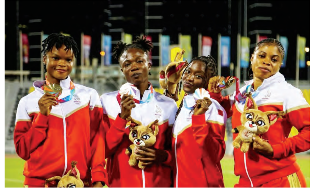
Women's 4x100m relay team celebrate golden finish