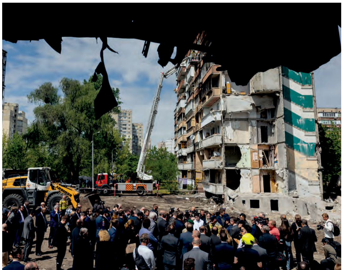
Members of diplomatic missions to Ukraine are standing near a residential building that was partially destroyed following Russian drones and missiles strikes in Kyiv

Kyiv freed the same number of Russian soldiers.