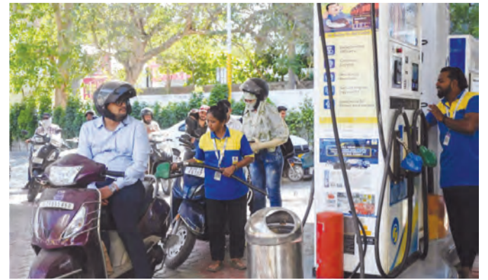
A staff worker fills petrol in a scooter at a fuel station in Ahmedabad