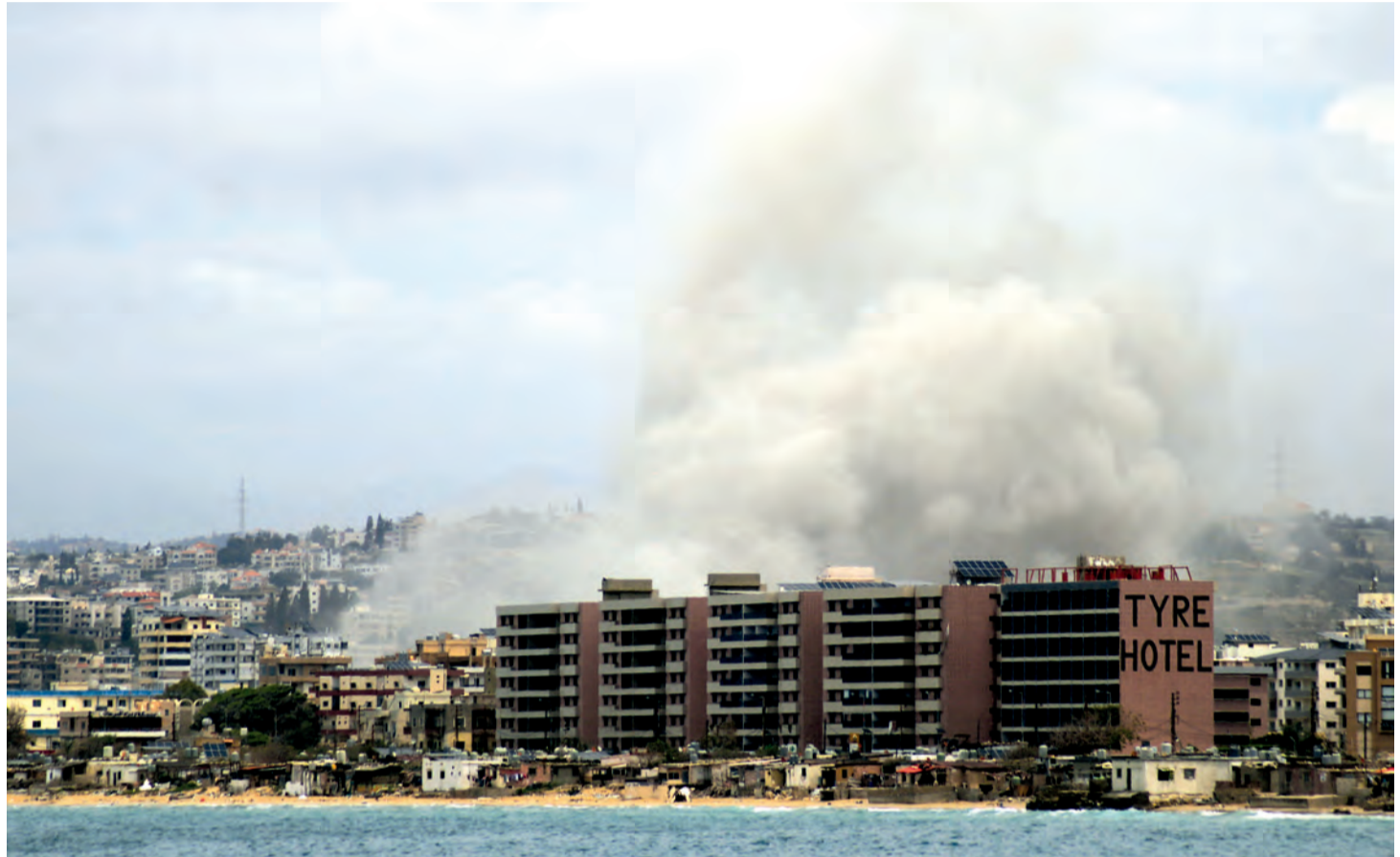
Smoke rises from the site of an Israeli airstrike that targeted a neighbourhood in the southern Lebanese city of Tyre

Lebanon’s health ministry said the strikes on the Tyre district wounded at least 37 people, including six hospital personnel, nine women and four children.