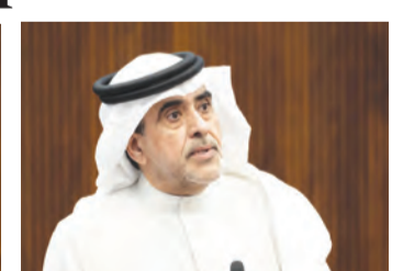
Khalid Buanaq, MP