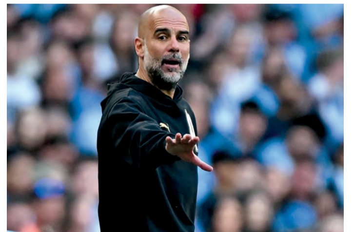
Pep Guardiola reacts during a match (file photo)

It depends on the trophies you lift. Sometimes you lift trophies and the season has been successful. Sometimes, you lift and the truth is the season has been really, really bad