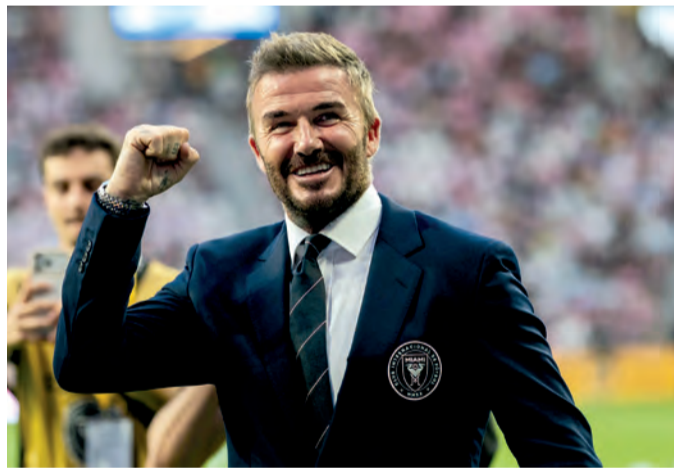
David Beckham, Co-owner of Inter Miami CF, reacts prior to an MLS match