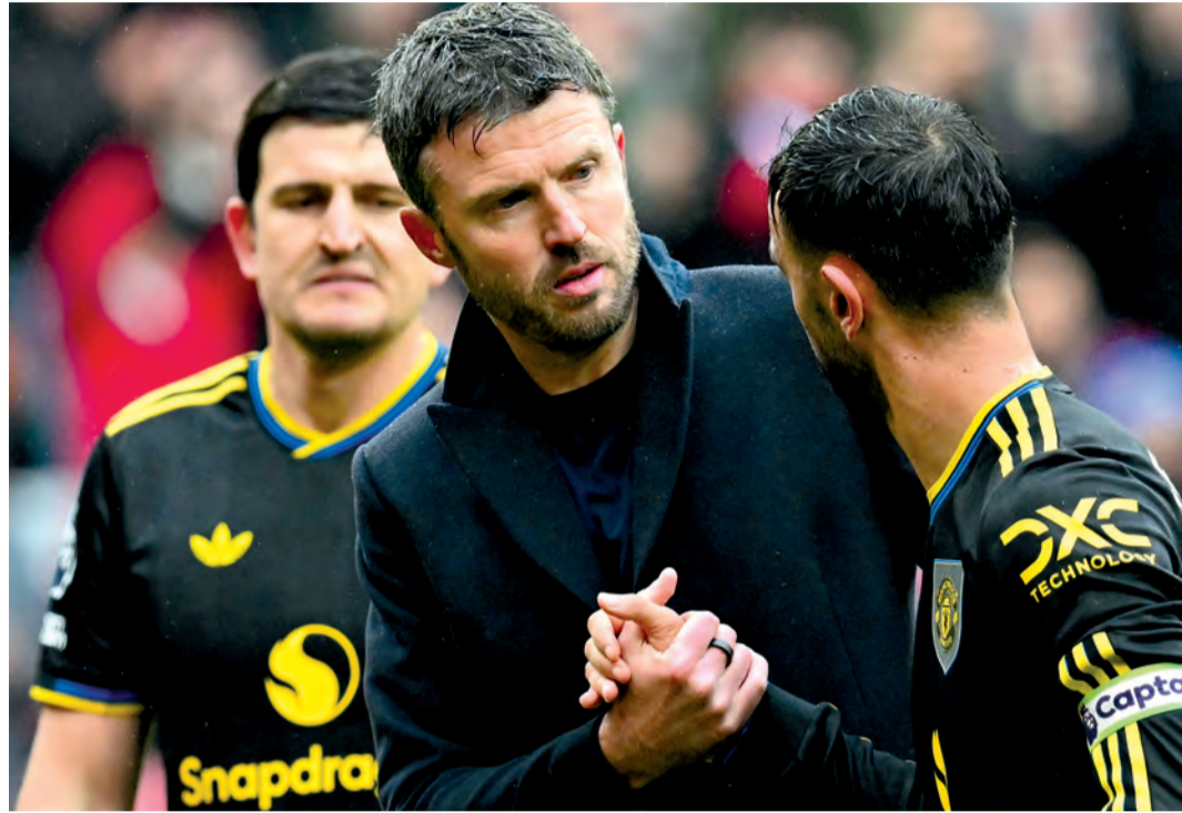
Manchester United's interim head coach Michael Carrick congratulates Portuguese midfielder #08 Bruno Fernandes

year deal for Carrick, with the option of a further season, are believed to be underway and could be concluded by the end of the week.