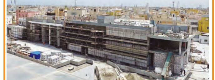
Qalali Health Centre Project

● Health hub, backed by Bank of Bahrain and Kuwait, hits 46% completion