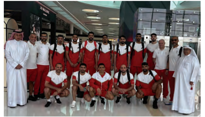
Bahrain national volleyball team with team officials