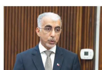
Ebrahim Al Hawaj, Minister of Works

Al Hawaj also highlighted upcoming strategic projects, including the planned Fourth Bridge linking Muharraq and Manama, as well as upgrades to airport access roads, highways,