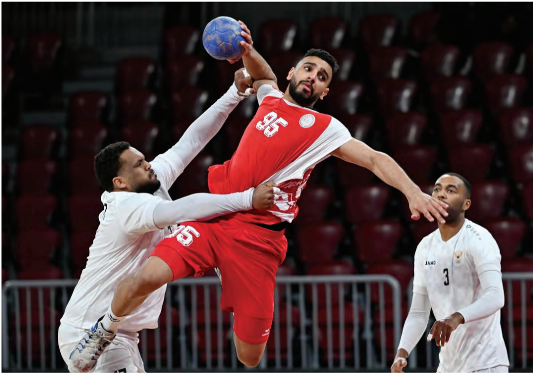
Action from Bahrain's handball match against Kuwait