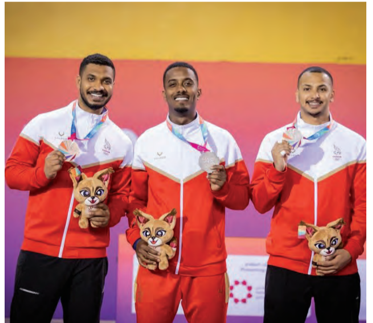
Bahrain's men's fencing team celebrate silver in the foil competition.