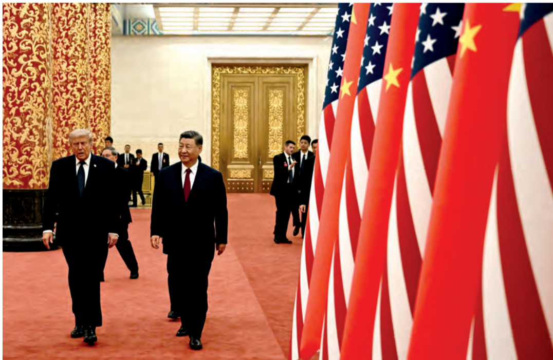
China's President Xi Jinping (R) and US President Donald Trump arrive to attend a state banquet at the Great Hall of the People in Beijing

But there have been no formal announcements, and the Chinese foreign ministry would not confirm or deny Trump's statements