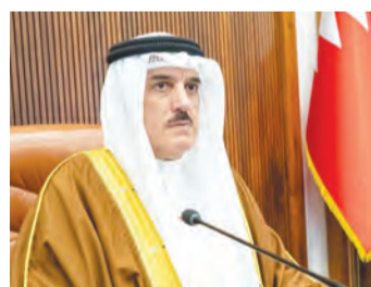
Ahmed Al Musallam, Speaker of Parliament

It said it was ready to take part in the media and awareness side