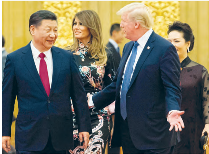
US President Donald Trump (2nd R) speaks to China's President Xi Jinping (L) in front of US First Lady Melania Trump (2nd L) and Xi's wife Peng Liyuan (R) in the Great Hall of the People in Beijing

Euro/pound: ▼ at 87.08 pence from 87.09 pence