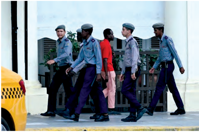
Cuban police officers walk on a street in Havana

Photos posted by the agency on X showed Ratcliffe alongside several people with blurred-