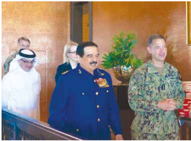
HM King Hamad bin Isa Al Khalifa and HRH the Crown Prince and Prime Minister Salman bin Hamad Al Khalifa received US CENTCOM Commander Admiral Brad Cooper during his visit to Bahrain on April 13.

The US ambassador highlighted the close coordination between US forces and the Bahrain Defence Force, stressing that the partnership remains central to protecting Bahrain's sovereignty and security.