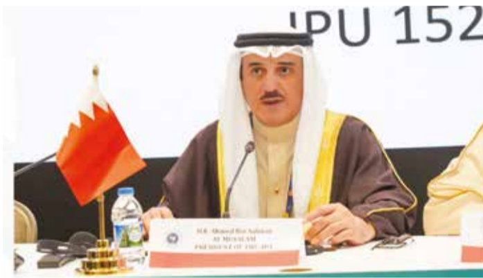
Ahmed Salman bin Musallam, President of the Asian Parliamentary Assembly and Speaker of the Parliament

Ahmed bin Salman Al Musallam, President of the Asian Parliamentary Assembly and Speaker of Bahrain's Council of Representatives, warned that recent developments in the Middle East mark a dangerous escalation threatening regional and global security.