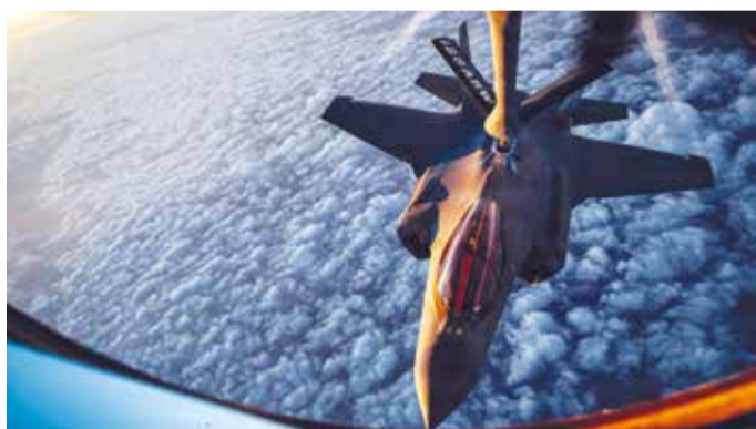
A US Air Force KC-135 Stratotanker aircraft refuelling a US Air Force F-35A Lightning II aircraft during Operation Epic Fury in the US Central Command area of responsibility

In a statement carried by Iranian state television, the head of the military's central command centre said if the US continues with its blockade and "creates insecurity for Iran's commercial vessels and oil tankers", it will also constitute "a prelude" to violating the ceasefire.