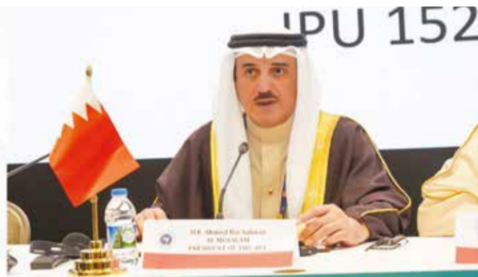
Ahmed Salman bin Musallam, President of the Asian Parliamentary Assembly and Speaker of the Parliament

Ahmed bin Salman Al Musallam, President of the Asian Parliamentary Assembly and Speaker of Bahrain's Council of Representatives, warned that recent developments in the Middle East mark a dangerous escalation threatening regional and global security.