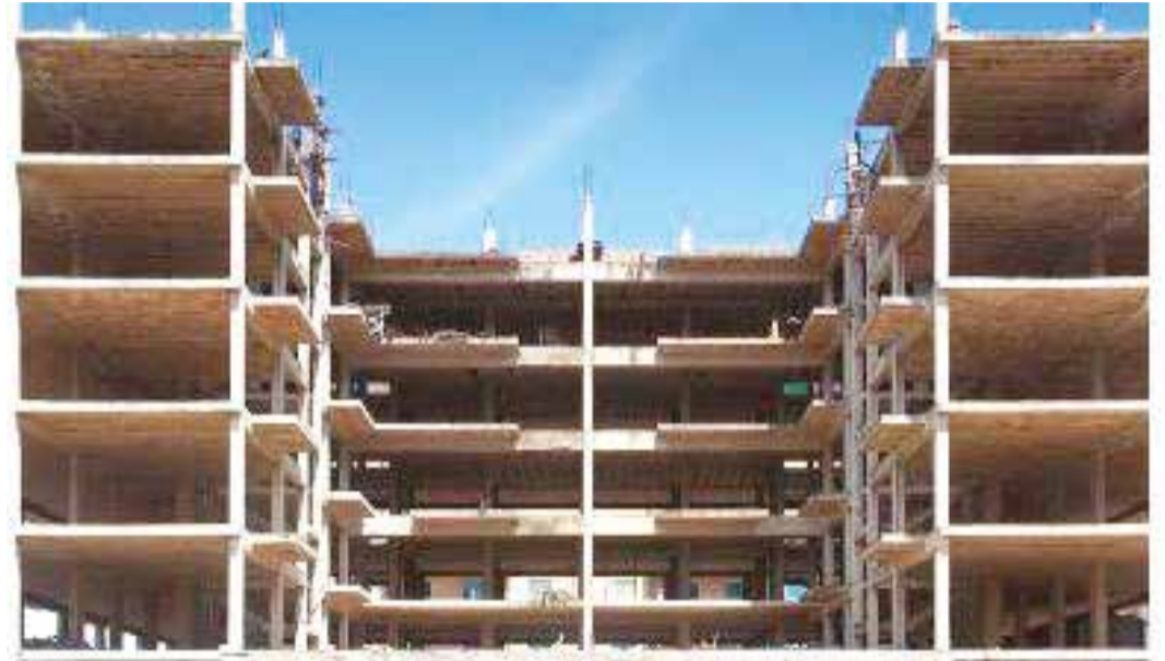
Stalled buildings in Bahrain

Under the new plan, buildings left incomplete for more than a year—particularly those facing main roads—could have their façades temporarily used for licensed advertising under municipal supervision.