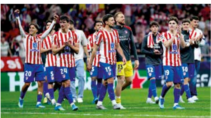
Atletico Madrid's players celebrate at the end of the match

“We'll go into it with all our hope, with total belief. We know the strengths we have and our flaws,” said Simeone.