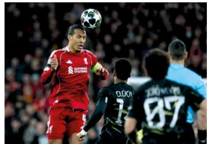
Liverpool captain Virgil van Dijk heads the ball