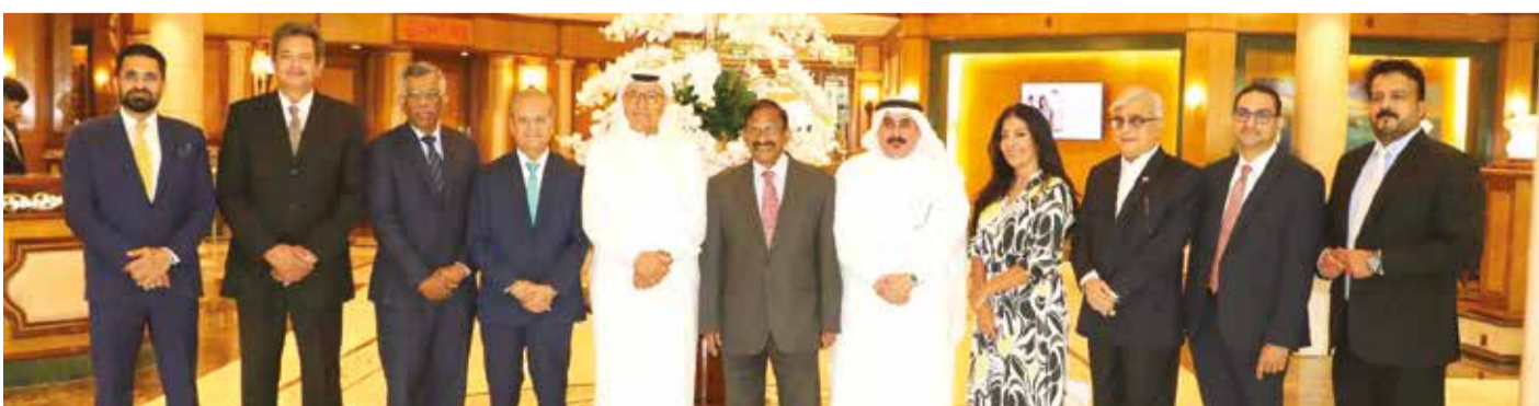
Members of the Bahrain India Society are seen during a recent Board meeting. They expressed deep appreciation and respect for the leadership of the Kingdom of Bahrain, commending its continued efforts in safeguarding national security, maintaining stability, and ensuring the well-being of citizens and residents. The Society also highlighted the vital role of Bahrain's security institutions—including the Bahrain Defence Force, National Guard, and Civil Defence—in preserving public safety and strengthening social cohesion. The meeting further reviewed ongoing community initiatives and discussed upcoming programmes aimed at enhancing cooperation and cultural ties between Bahraini and Indian communities, in line with the Kingdom's vision of unity, inclusiveness, and sustainable development. (By Pradeep Puravankara)