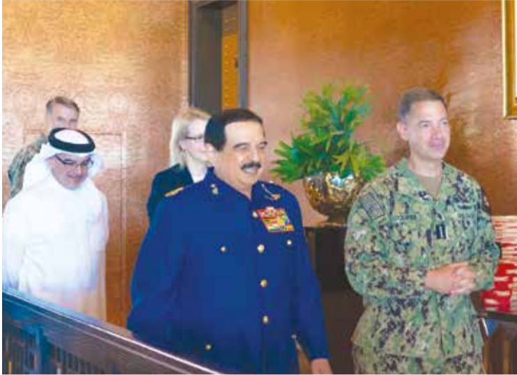
HM King Hamad bin Isa Al Khalifa and HRH the Crown Prince and Prime Minister Salman bin Hamad Al Khalifa received US CENTCOM Commander Admiral Brad Cooper during his visit to Bahrain on April 13.

The US ambassador highlighted the close coordination between US forces and the Bahrain Defence Force, stressing that the partnership remains central to protecting Bahrain's sovereignty and security.