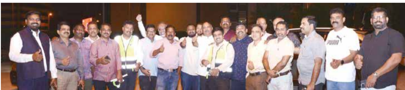
The Kerala Social Forum (BKSF) and the Bahrain Malayalee Business Forum (BMBF) have jointly launched special relief charter flights to support Indian expatriates facing travel disruptions amid the ongoing Middle East crisis. The initiative, organized on April 14 and 15 at the Golden Tulip Hotel in Manama, offered a historic all-inclusive travel package priced at BD 220, covering airfare, ground transport, and meals. (By Pradeep Puravankara)