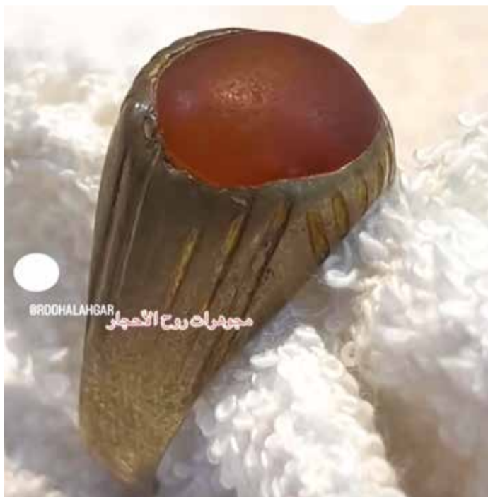
A 130-year-old agate