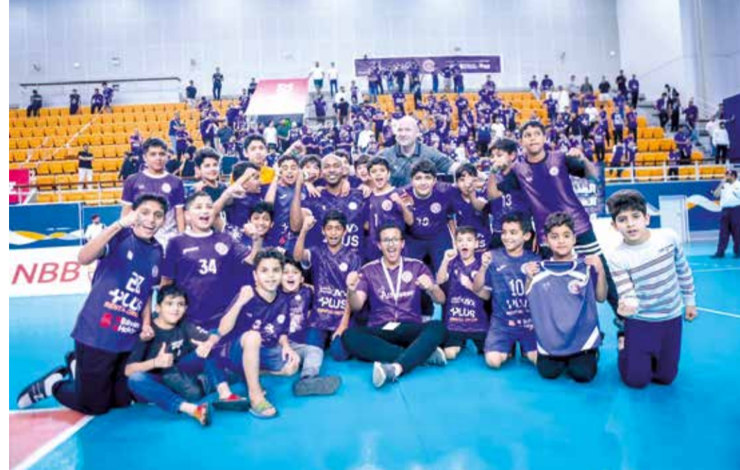
Fans embrace the Kenyan star after his performance at Isa Sports City

ing the opening set 25-19 with sharp attacking play. Dar Kulaib responded immediately, raising their tempo and stabilising their reception to swing momentum.