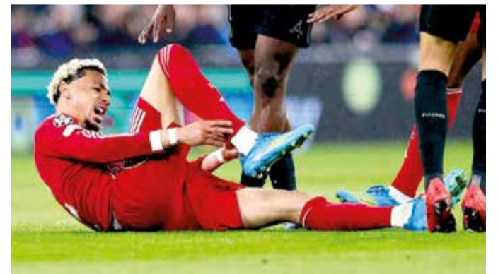
Hugo Ekitike goes down injured during Liverpool's match against PSG