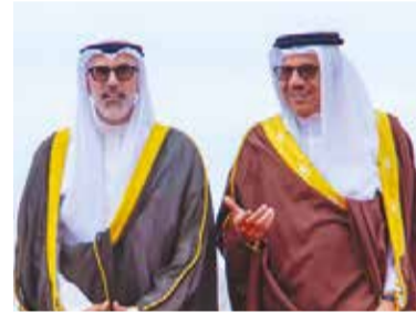
Foreign Minister welcomes Kuwait Foreign Minister upon arrival in Manama.

in strengthening bilateral ties and praising the close fraternal relations between the two countries under His Majesty the King's leadership.