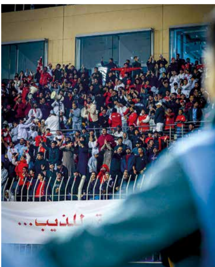
Muharraq fans in full voice at a previous match

Al Budaiya, meanwhile, are in transition in 10th place following the departure of Sayed Hassan Isa, with Adel Al Noami now in charge. Their 2-0 defeat in the last round exposed ongo-