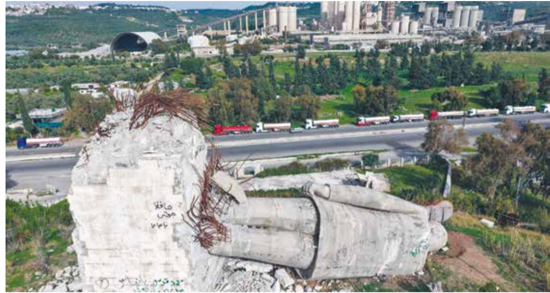
An aerial photograph shows a destroyed statue of the late Syrian president Hafez al-Assad, as a long line of Iraqi diesel-laden tanker trucks line up along the Tartus-Baniyas highway waiting to unload their cargo at the Baniyas port refinery on the Mediterranean Sea

detail the economic impact of the conflict.