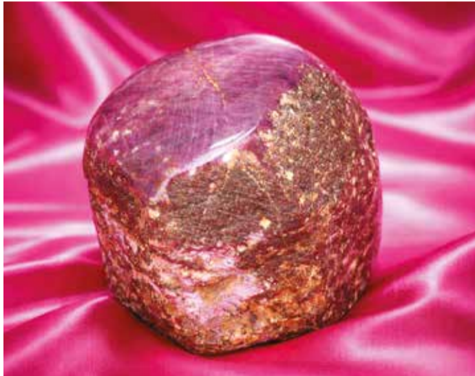
A natural star ruby weighing more than 2.5 kilograms, and cost more than BD35,000

- HUSSEIN AL DARAJI, OWNER OF ROOH AL AHGAR JEWELRY