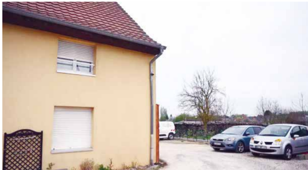
Police found the nine-year-old lying in the fetal position inside a van in the eastern village of Hagenbach

He has admitted the charges and claimed he sought to