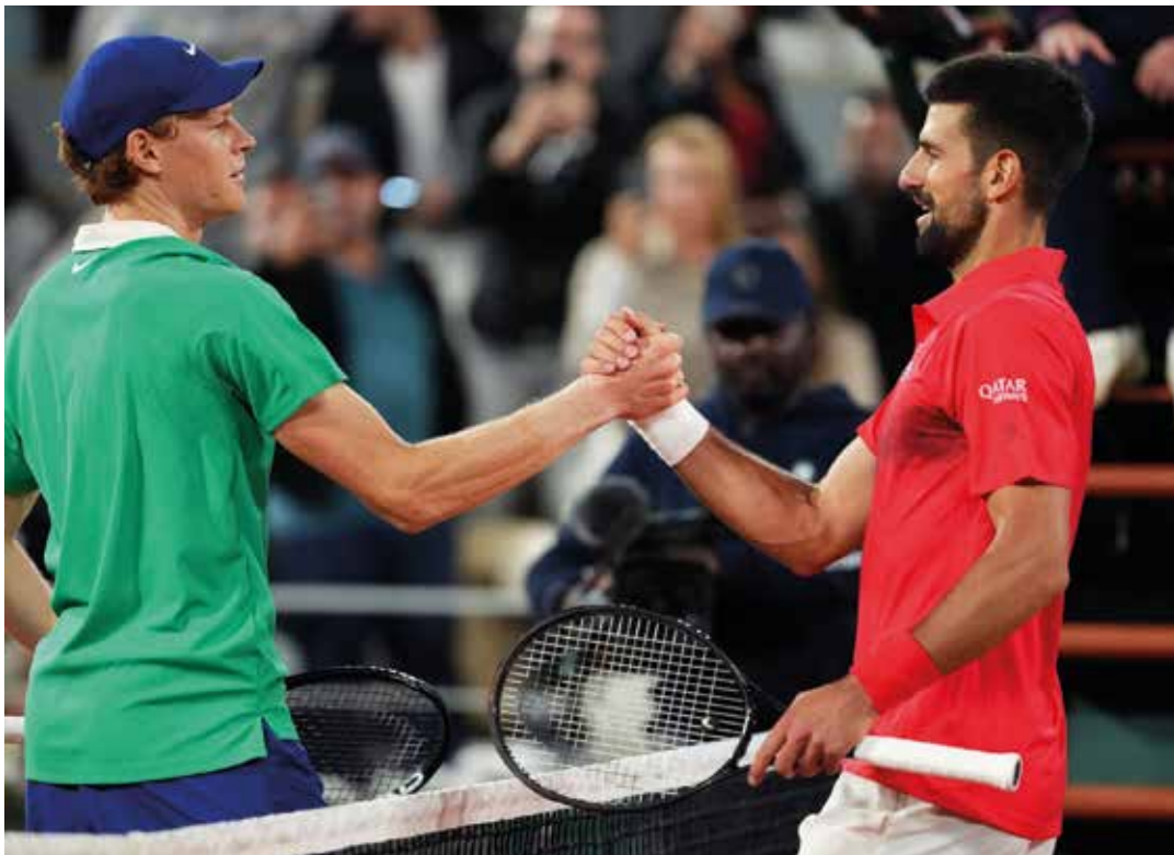
Italy's Jannik Sinner (L) shakes hands with Serbia's Novak Djokovic after winning their French Open match (file photo)

The Spanish superstar is on the same side of the draw as last year's beaten finalist Alexander