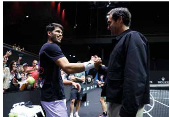
Carlos Alcaraz and Roger Federer shake hands during after a Laver Cup match (file photo)

"Let's see if he's able to do 'crazy' this week. I hope he does because for the game that would be an unbelievable and special