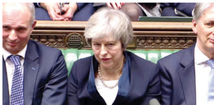
May sits down in Parliament after the vote on Brexit deal.

British Prime Minister Theresa May received a crushing defeat in a his-