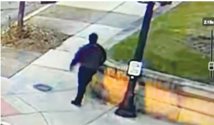
the suspect in the Brown University shooting walking along a road near the campus in Providence