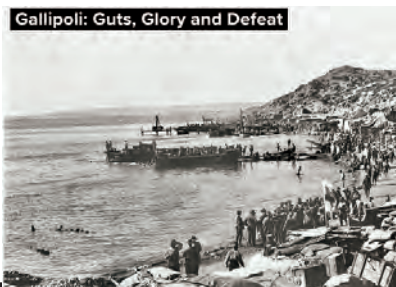
Gallipoli: Guts, Glory and Defeat

Bartolomeu Dias returns to Portugal after becoming 1st known European to sail round the Cape of Good Hope