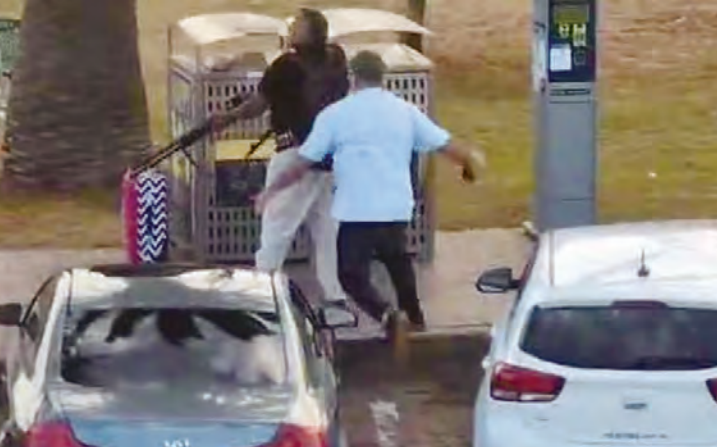
As the terrorist sprayed bullets at helpless people, a citizen leapt forward, forcing the gun from his hands as more help arrived. Prime Minister Anthony Albanese hailed ordinary citizens who tackled and disarmed one of the gunmen as "heroes".

"This is a targeted attack on Jewish Australians on the first day of Hanukkah, which should be a day of joy, a celebration of faith -- an act of evil, antisemitism, terrorism that has struck the heart of our nation," Albanese said.