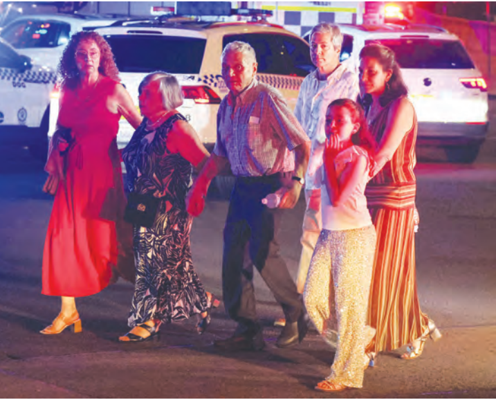
People cross a street next to police vehicles after a shooting incident

"An attack on Jewish Australians is an attack on every Australian," Albanese said.