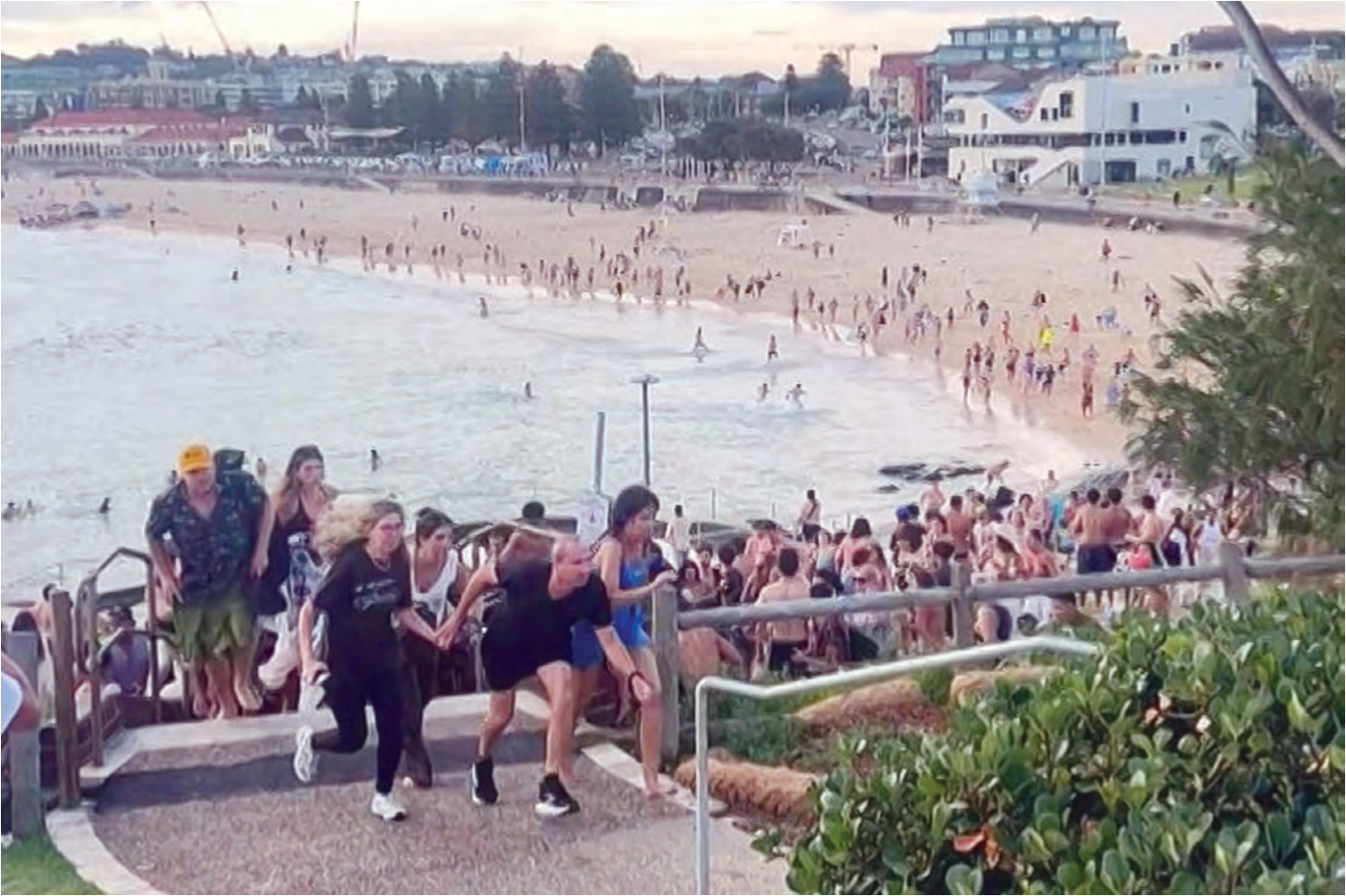
Beach-goers fleeing Bondi Beach after gunmen opened fire, in Sydney

Emergency responders rushed at least 29 people to local hospitals