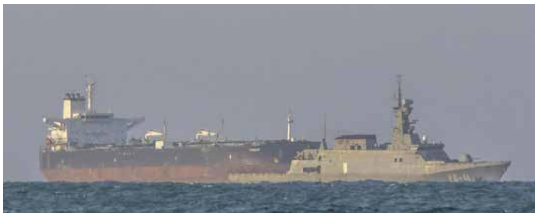
A Venezuelan navy patrol boat escorts Panamanian flagged crude oil tanker Yoselin near the El Palito refinery in Puerto Cabello, Venezuela