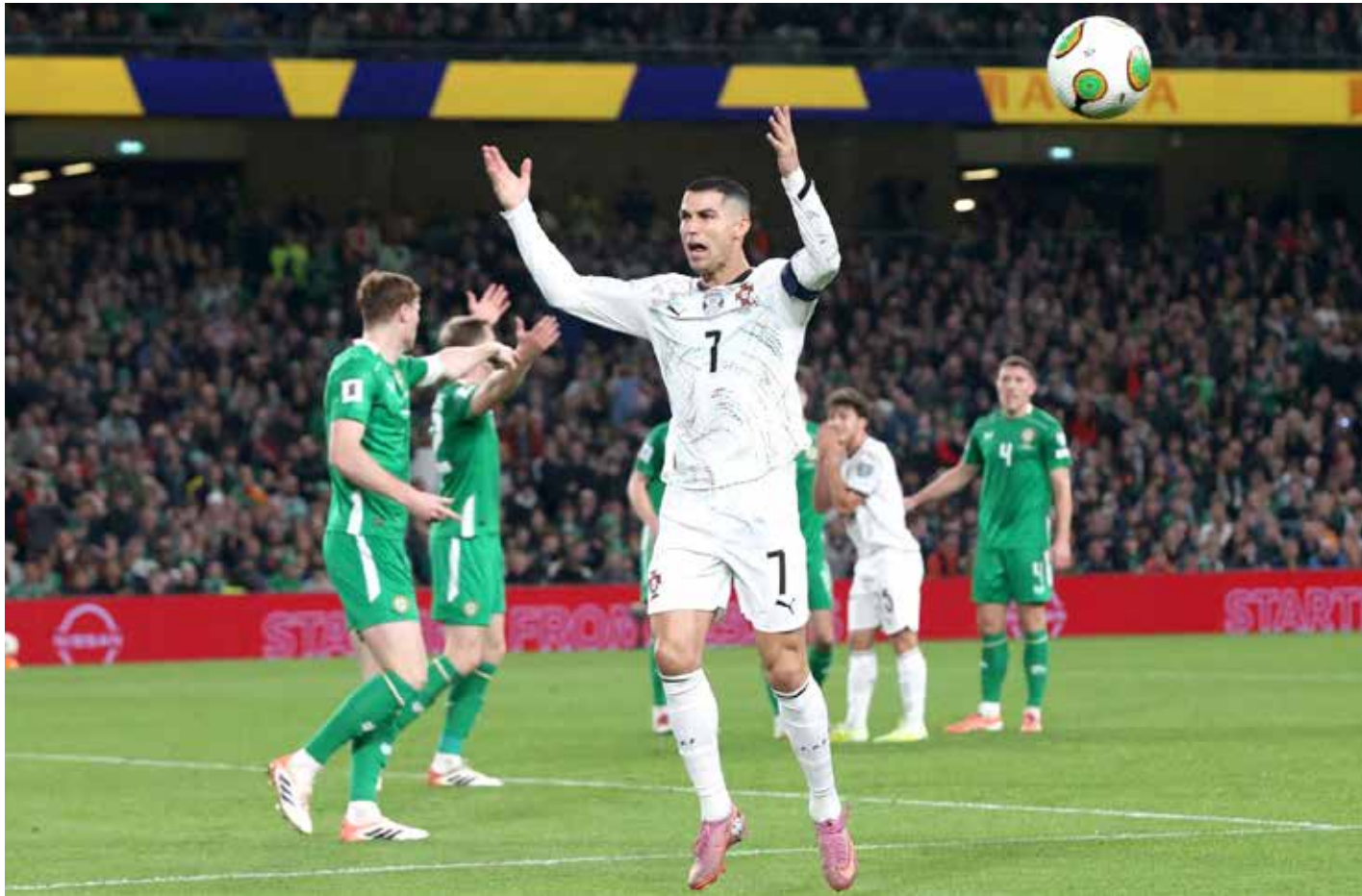
Portugal's forward Cristiano Ronaldo reacts during the match

Given the context tonight, we are pleased to have put some smiles on faces by securing qualification. We have fulfilled our objective. I understand that it is seen as normal that France qualify but we still had to go out and do it, so we are very proud