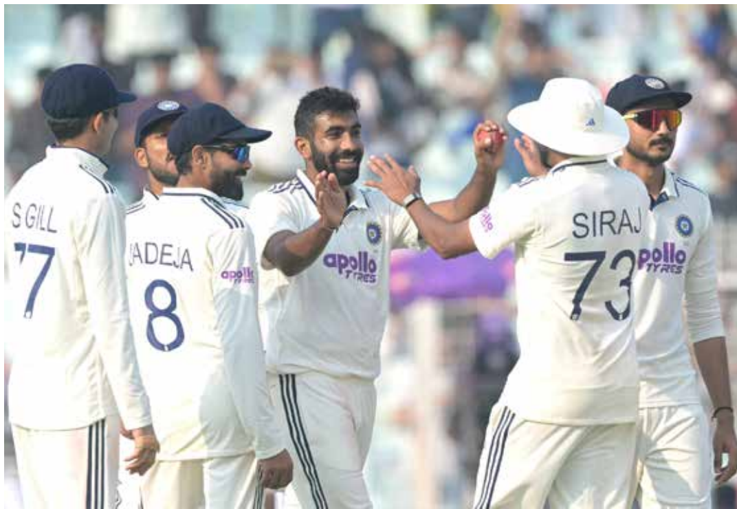
India's Jasprit Bumrah (C) celebrates after taking five-wicket haul

setback even before a ball was bowled when their premier fast bowler Kagiso Rabada was ruled out with a rib injury.