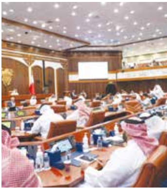
the reorganisation of the Commission.