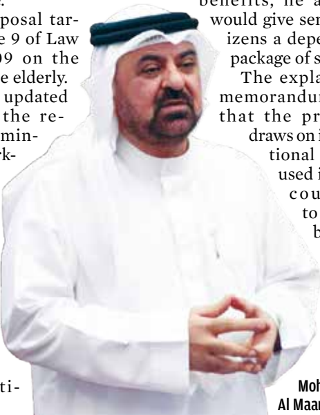
Mohammed Al Maarafi, MP

The proposal targets Article 9 of Law 58 of 2009 on the rights of the elderly. Under the updated wording, the responsible ministry — working with the committee for elderly affairs — would issue the Elderly Service Card to Bahraini senior citizens.