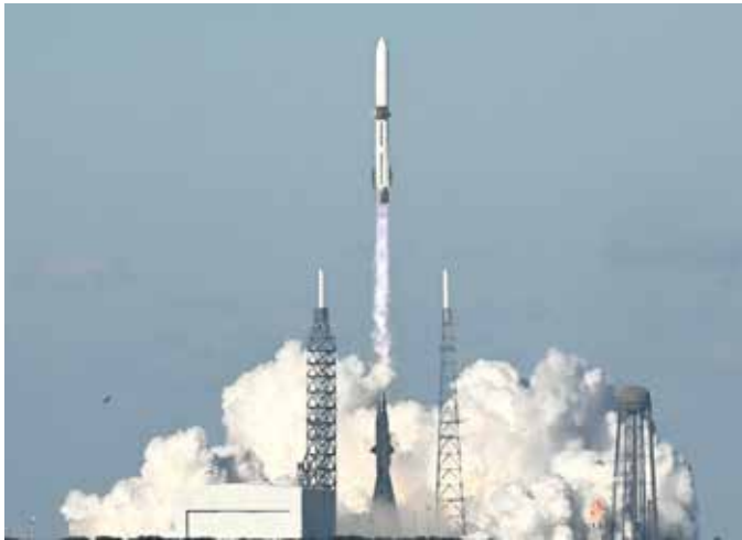
Blue Origin's New Glenn rocket lifts off for its second mission, the NG-2, from Space Launch Complex 36 at the Space Force Station in Cape Canaveral, Florida