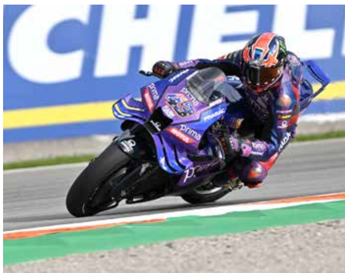
Prima Pramac Yamaha MotoGP team's Australian MotoGP rider Jack Miller takes part in a practice session