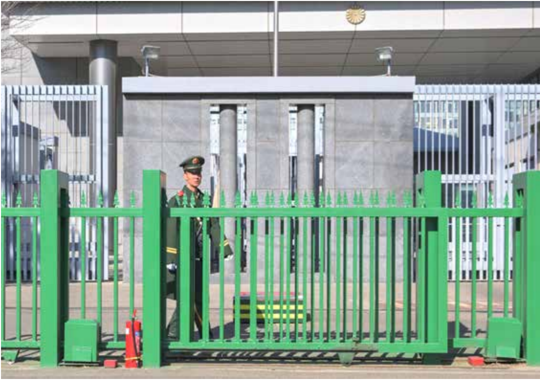
member of security stands guard at the Japanese embassy in Beijing

It said Sun made "serious demarches over Japanese Prime