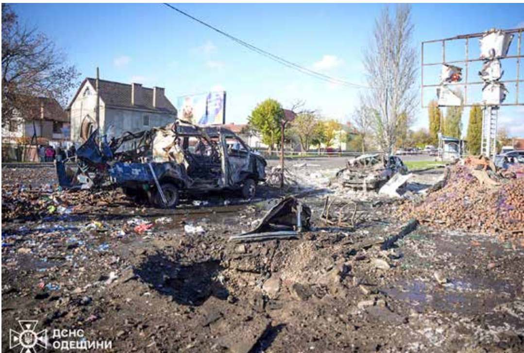
Destroyed cars are seen at the site of an air-attack, in Chornomorsk, Odesa region

In the east of the city, where rescue workers were clearing