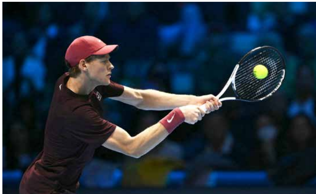
Italy's Jannik Sinner hits a return against USA's Ben Shelton

another final showdown against Carlos Alcaraz, who before yesterday's match was handed the award for securing the year-end top spot in the men's rankings.