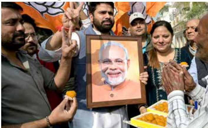
Supporters of the Bharatiya Janata Party (BJP) holding a photograph of India's Prime Minister Narendra Modi celebrate vote counting results of the party's victory in the Bihar assembly elections