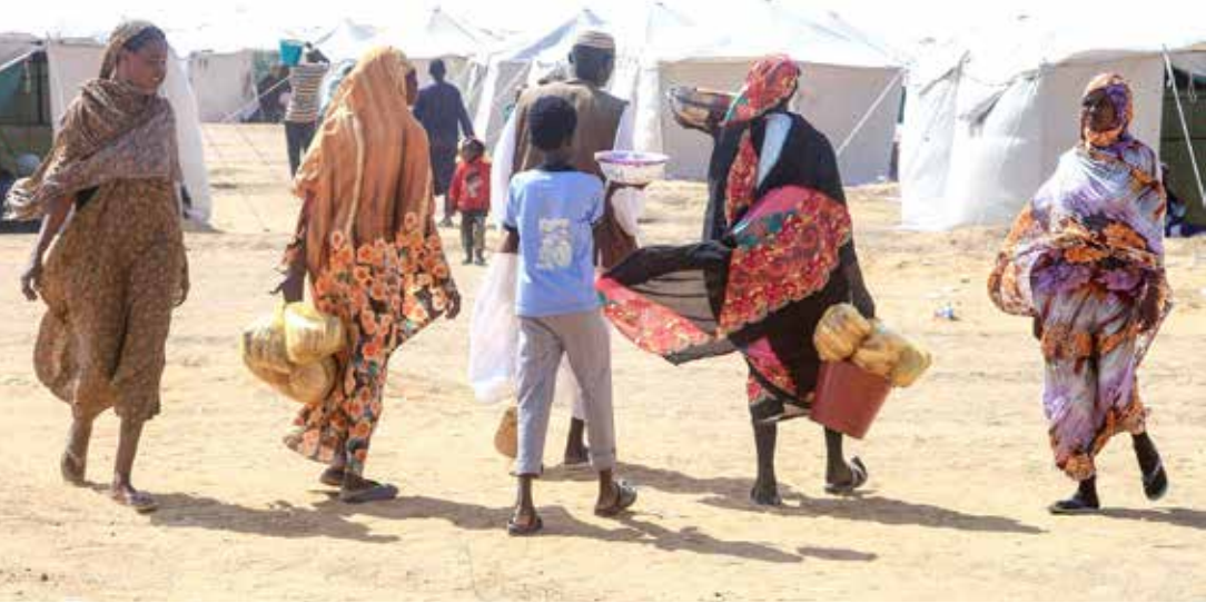
Sudanese people who fled El-Fasher prepare a meal at a camp for the displaced in the northern town of Al-Dabba

Since breaking out in April 2023, the war between Sudan's army and the paramilitary Rapid Support Forces has killed tens of thousands of people, displaced nearly 12 million more and trig-