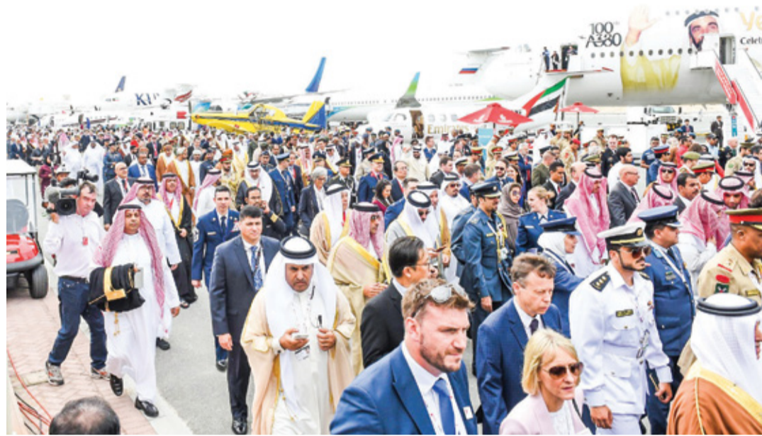
Hundreds took part in the air show inaugural event.

The first of those will be 'Into the Future Challenges and Opportunities for Gulf Region Airports and Airlines' which will be held today.