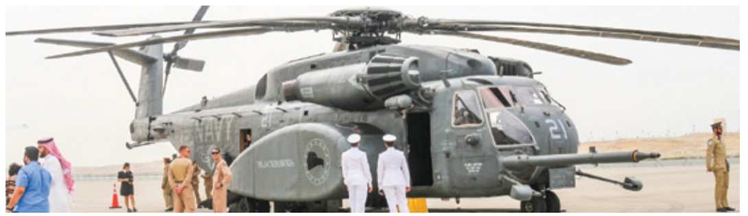
Top global aerospace, defence companies are displaying their latest military aircraft, vehicles at the air show.