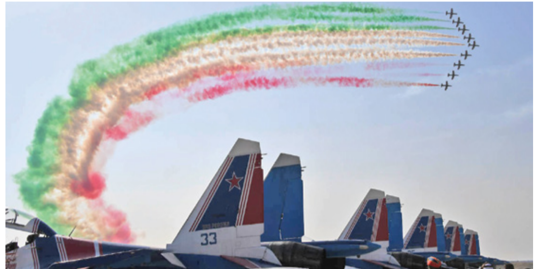
Various displays were performed by participating teams, adorning the skies.

being featured. Street performances include Bouncing Robot and 'Walkabout pilot'. Other