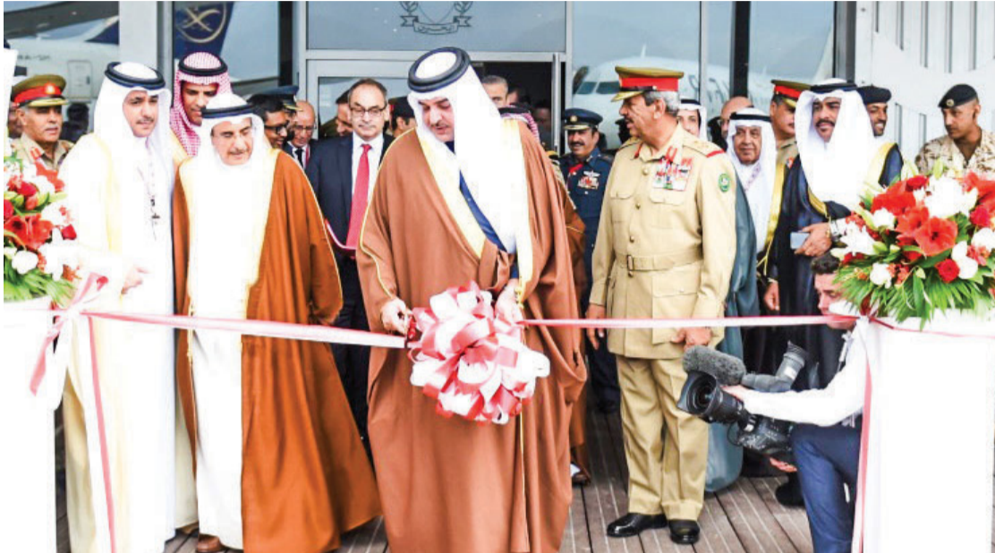
HH Shaikh Abdulla inaugurates the air show in the presence of senior government officials and dignitaries.

Top global aerospace companies taking part; event expected to make remarkable positive effect on the national economy