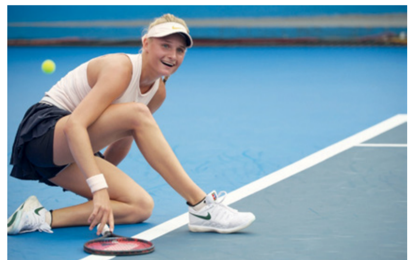
Dayana Yastremska of Ukraine celebrates her victory

Until yesterday, Yastremska's chief claim to fame had been 2016 Wimbledon girls singles finalist, but earlier this year she became the first player