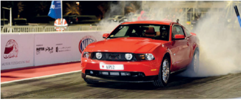
A car in action during a drag race