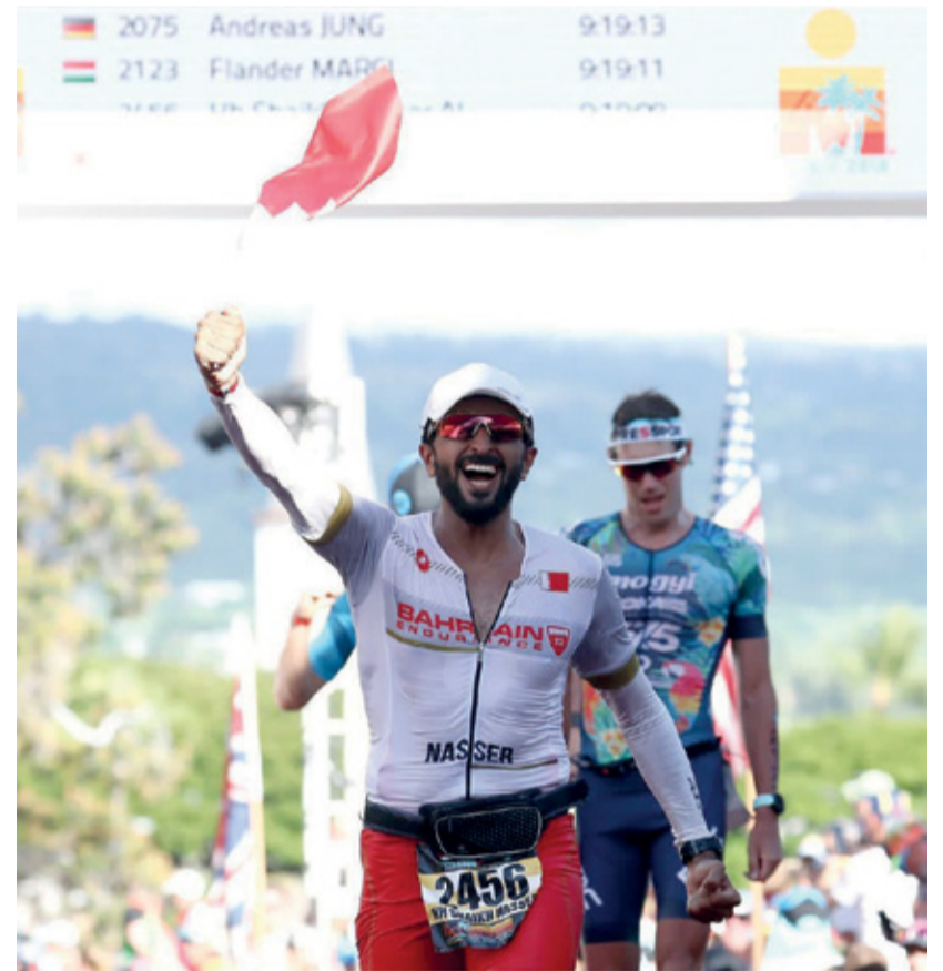
HH Shaikh Nasser bin Hamad Al Khalifa crossing the finish line

Shaikh Khalid affirmed that the unprecedented achievement of Shaikh Nasser is a clear result of the patronage and support of HM the King to Bahraini sports and athletes, which contributed to HH's achievement of this level of competition and honourable accomplishment.