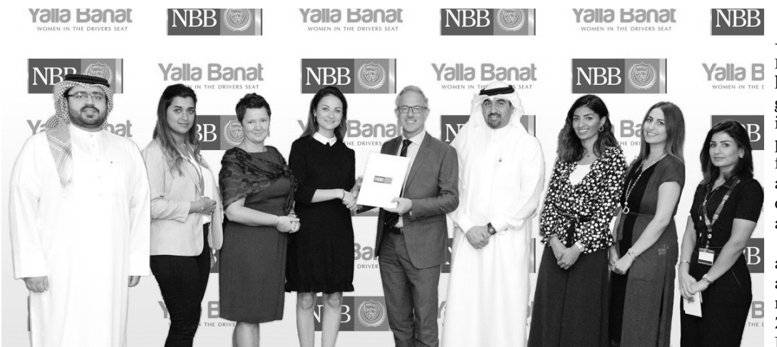
NBB continues support for women's empowerment with Yalla Banat partnership

The event will also comprise the first female motor show competition, which aims to symbolize the role that womforce in national and regional development today.