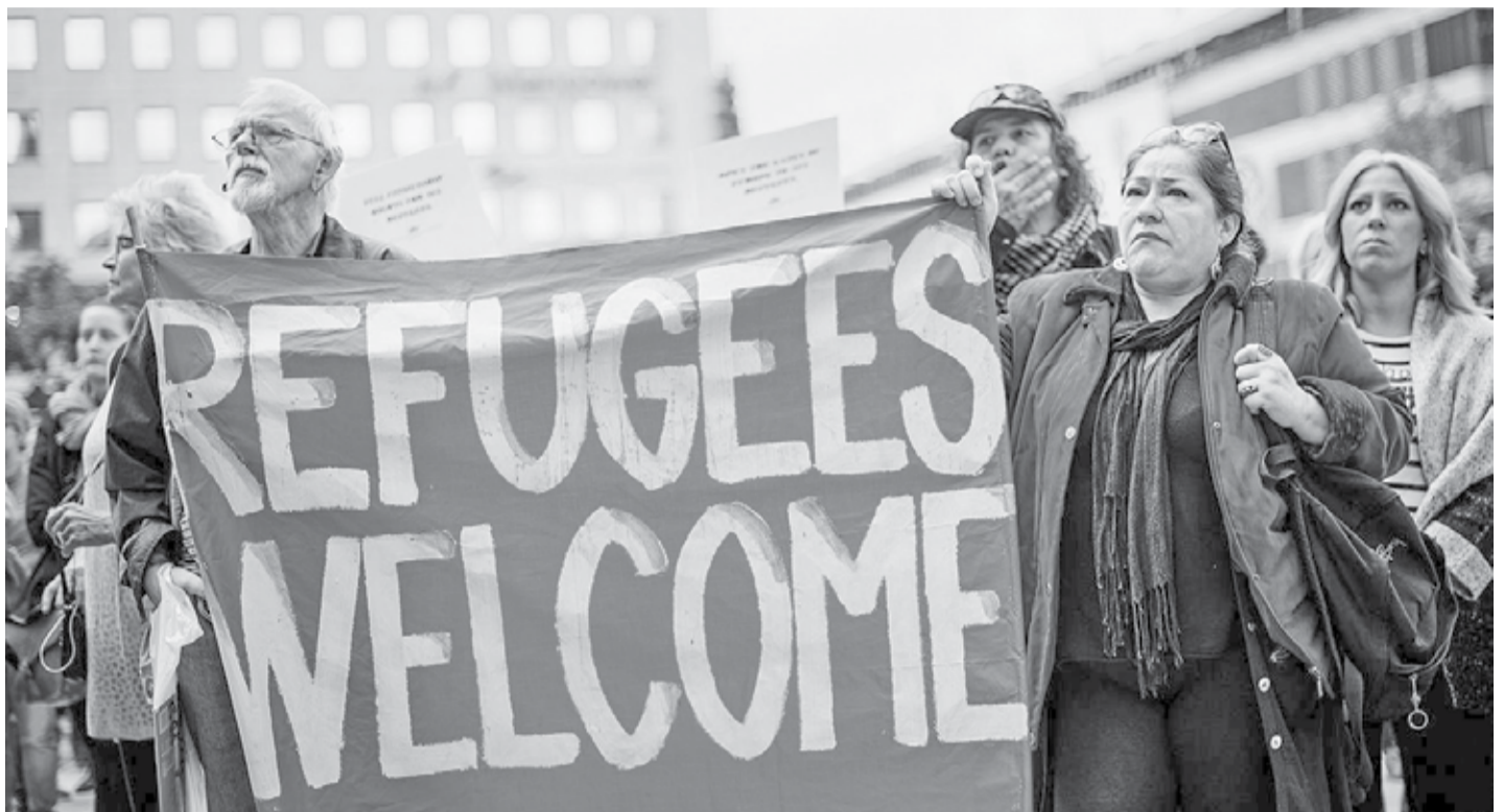
A demonstration in Stockholm welcoming the refugees.

She boarded a ferry with my 2-year-old mother and her baby brother and crossed the Mediterranean Sea in hope of a better future — just as many people are doing at this very moment,