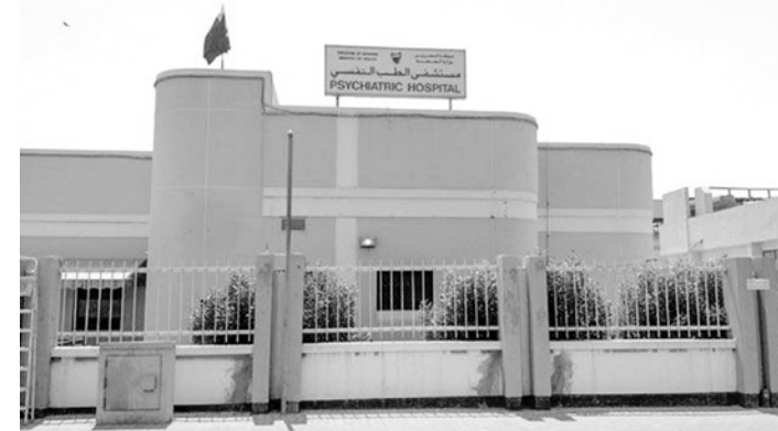
The functional difference be- The shortage of psychologists has led to delay in the treatment of many cases, sources say.

A Health Ministry source told Tribune: "The education of a psychiatrist is based on bioscience and brain and neuroscience sciences, while a psychologist's education mainly depends on behavior study.