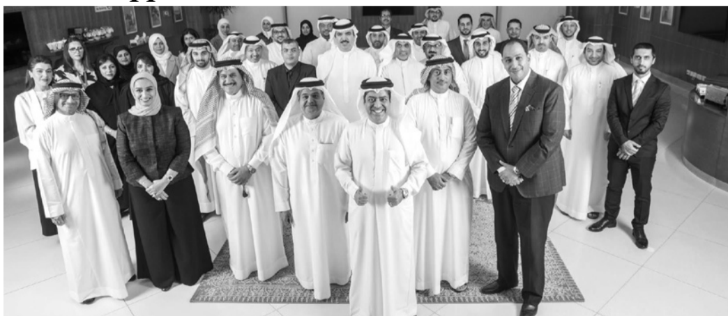
The Labour Market Regulatory Authority has expressed support to the campaign #Team Bahrain, which offers a tribute to all those who have been contributing towards the nation building.