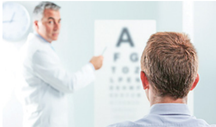
Periodic eye check-ups are recommended to prevent visual disabilities.

She commented: "There are 285 million visually impaired individuals worldwide in which 80pc of them could've avoided their impairment and 90pc of these individuals are from developing countries.