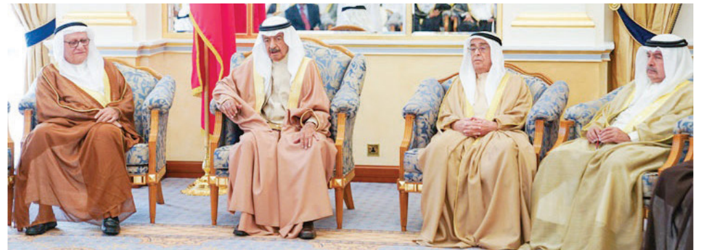
HRH the Premier receives senior officials, media persons and citizens.

Minister Prince Khalifa bin Salman Al Khalifa has underlined the Bahraini people's support to the Kingdom of Saudi Arabia against all conspiracies targeting it.