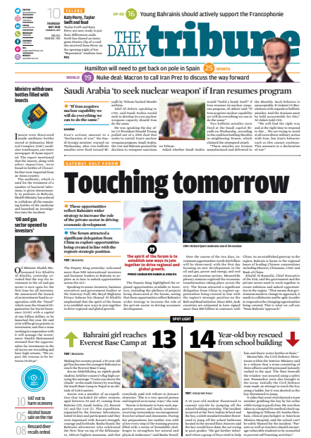
The Daily Tribune was relaunched on May 10, 2018.

"The drive, which is the first-of-its-kind in the Kingdom, offers our readers a