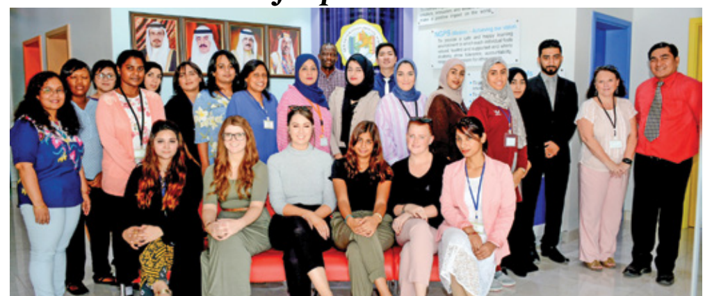
Following the successful launch of New Generation Private School (NGPS), an open event was held at the Ramee Grand Hotel to offer valuable insight into the school activities to the parents. The NGPS is a British curriculum school, with British management and under the supervision of a British educational consultancy.