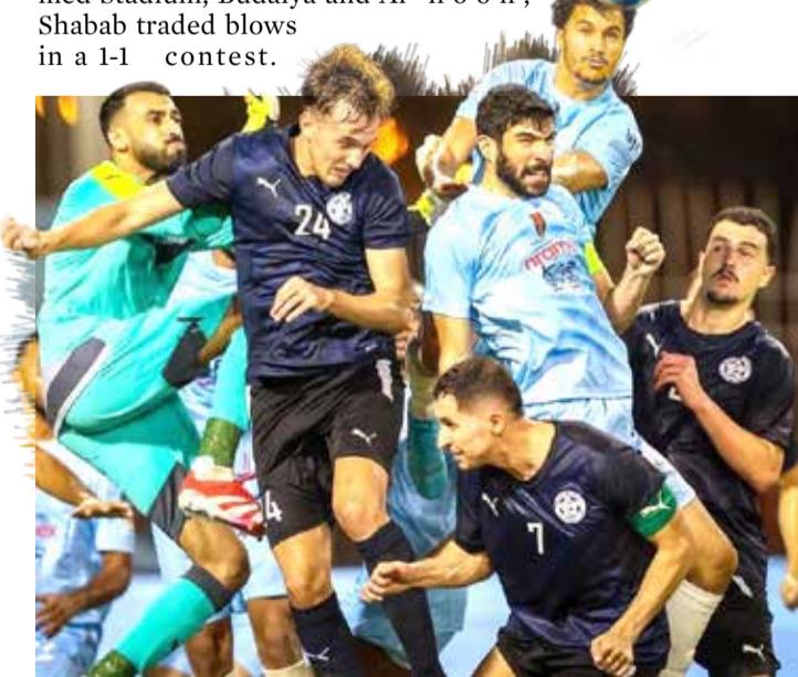
The equalizing moment for Riffa

Both matches highlighted the drama to come in a campaign played in a double round-robin format. The first round will stretch to matchweek 11, beginning January 8, 2026, before the second phase is scheduled later.