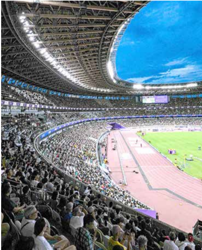
Spectators fill Tokyo National Stadium with 56,819 fans in attendance

Competing in front of 56,819 spectators at the National Stadium, Naser powered to victory