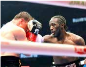
Terence Crawford lands a right on Canelo Alvarez

Terence Crawford stunned Mexican superstar Saul "Canelo" Alvarez to claim the undisputed super middleweight world boxing crown on Saturday, becoming the first man to win undisputed titles in three weight divisions. In a fight of razor-thin margins, Crawford poured it on