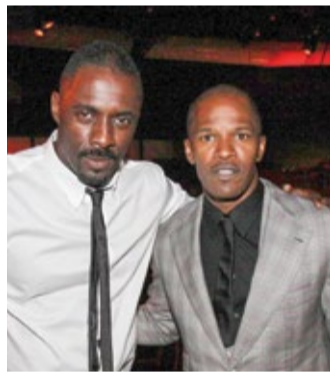
Idris Elba, Jamie Foxx

Foxx was disturbed when he got to know that he was not on the shortlist of actors for "Django" after Will Smith had passed on the part, and Elba was rumoured to in contention. In fact, when he got the chance to meet Elba, he tried to deter the actor from taking