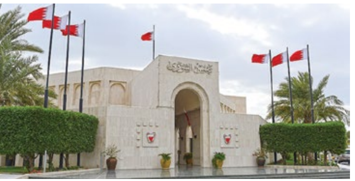
The Shura Council expressed utmost pride in the democratic achievements of the

She stressed that HM the King's The council praised the Bah- reform approach has put forward