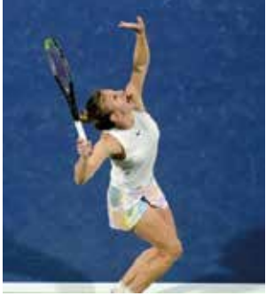
Simona Halep makes a serve