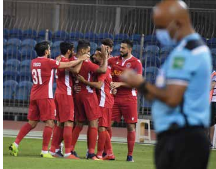
Muharraq players celebrating their goal in their win against Ahli

Games between Muharraq and Ahli are dubbed as the King-