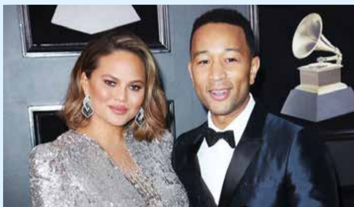
Chrissy Teigen and John Legend

again omg," a fan tweeted, adding a handful of crying emojis.